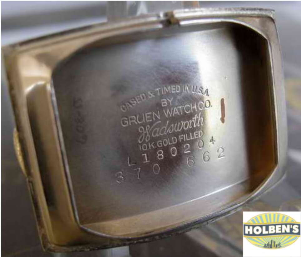
4) Gruen Curvex Evans -from the book The 1950s page 165.jpg , downloaded 3062 times