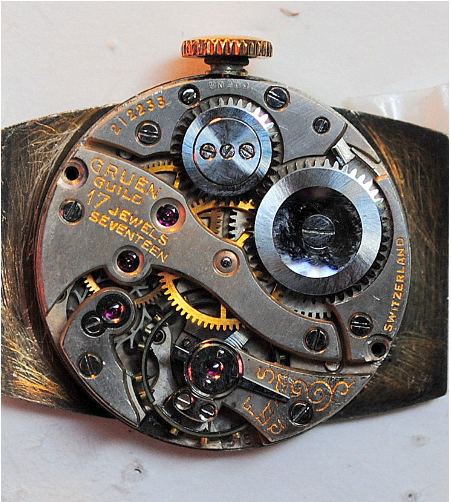
2) Gruen 315_3 top plate.JPG , downloaded 2180 times