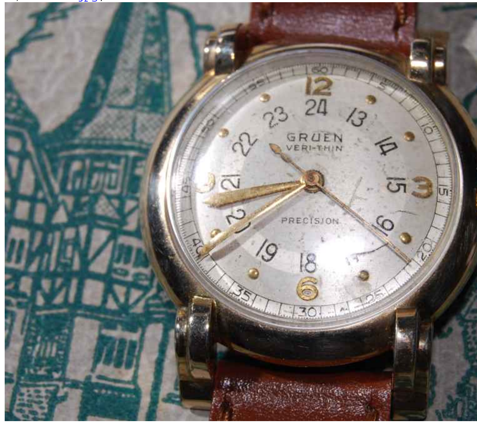
4) PanAm3.jpg, downloaded 2214 times