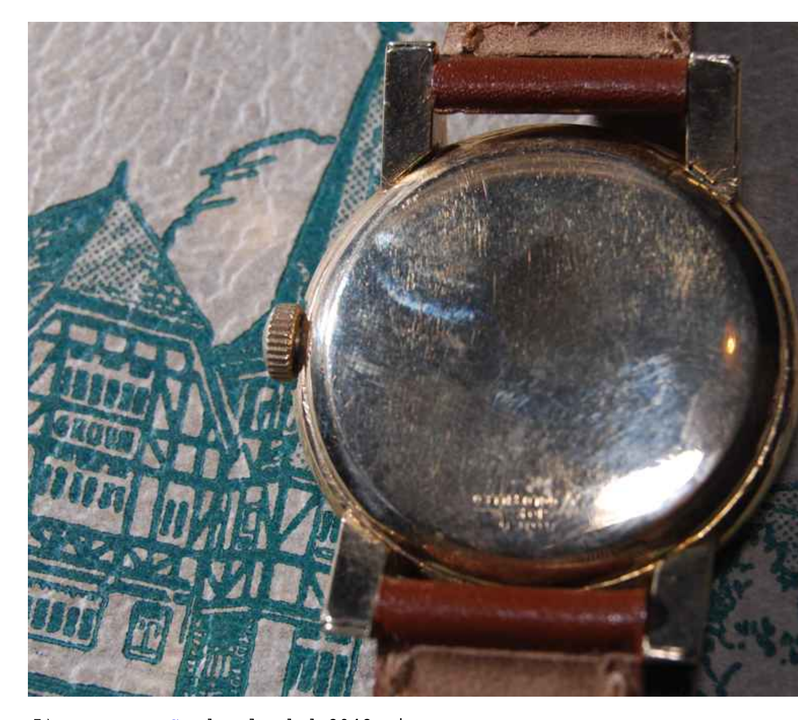
5) Pan Am.JPG, downloaded 2042 times