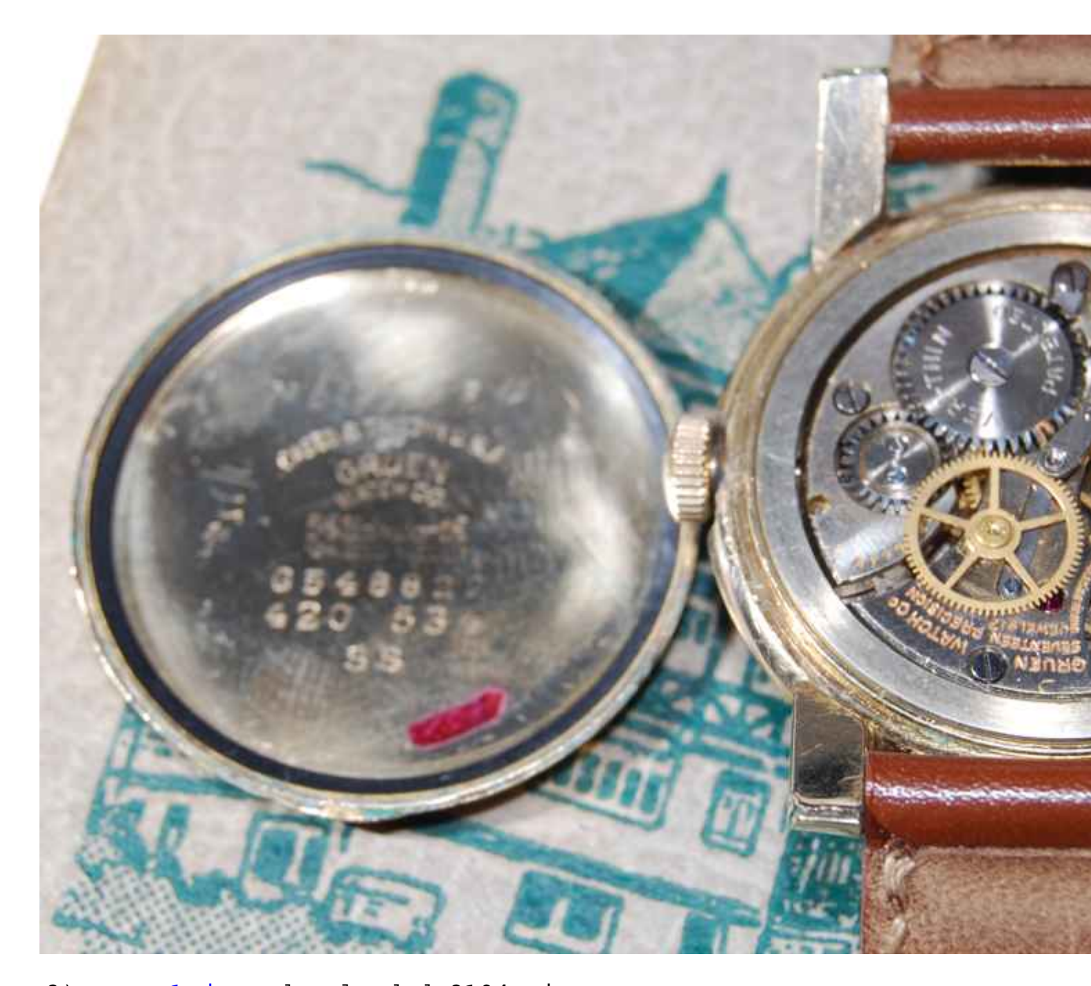
2) PanAm1.jpg, downloaded 2194 times