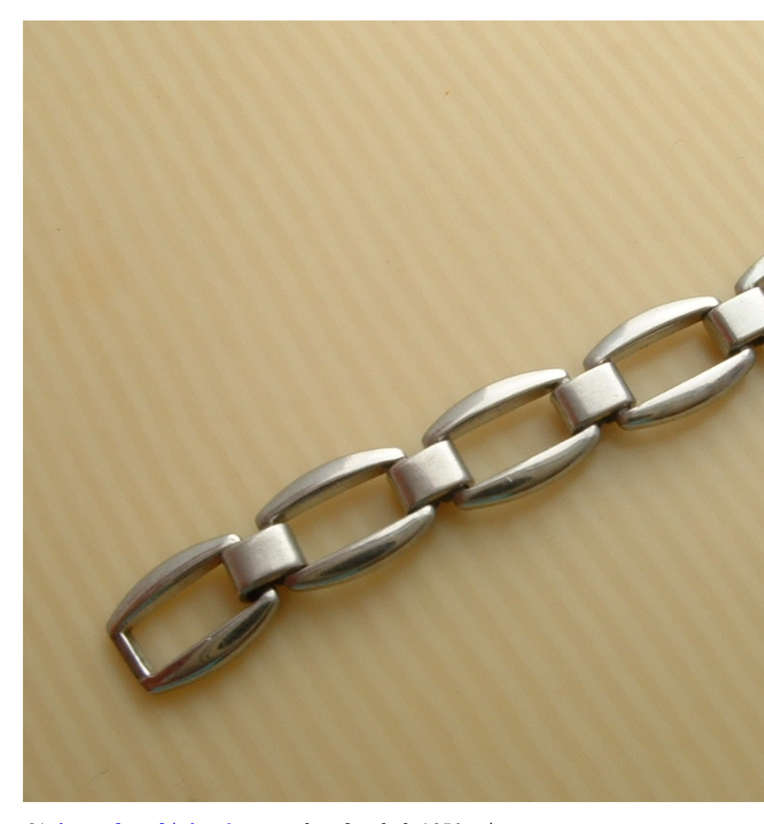
3) bracelet links 2.JPG, downloaded 1059 times