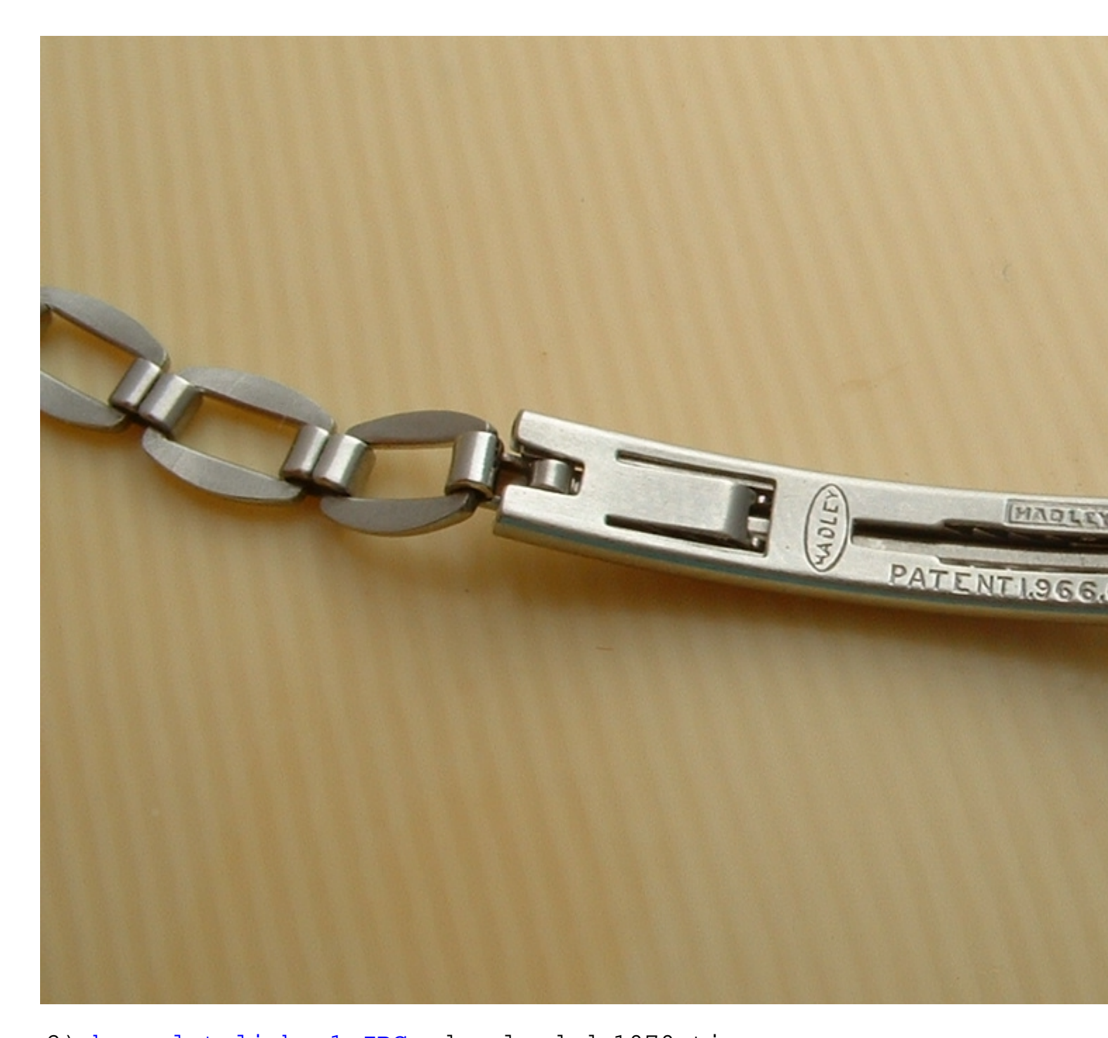
2) bracelet links 1.JPG, downloaded 1070 times