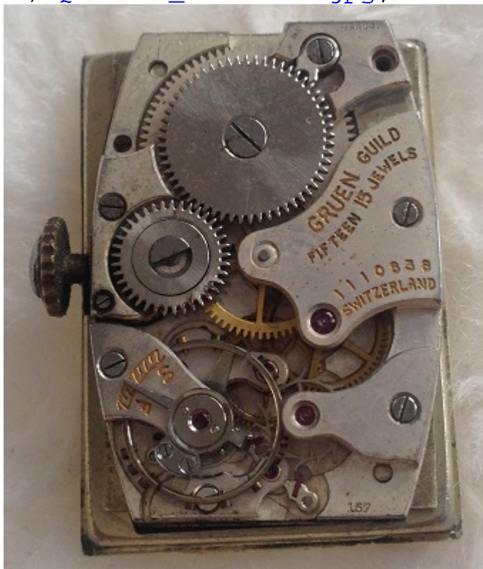
5) Quadron_case_inside.jpg , downloaded 1643 times