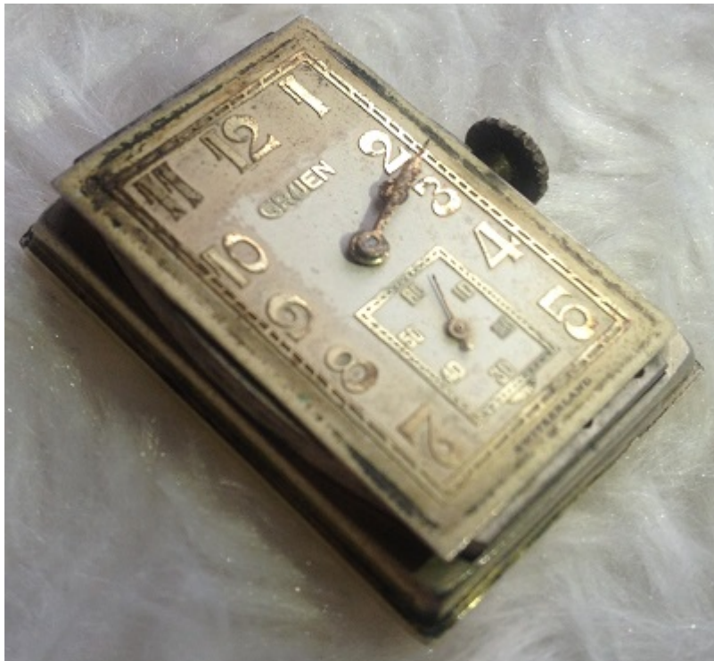
4) Quadron_movement.jpg , downloaded 1664 times