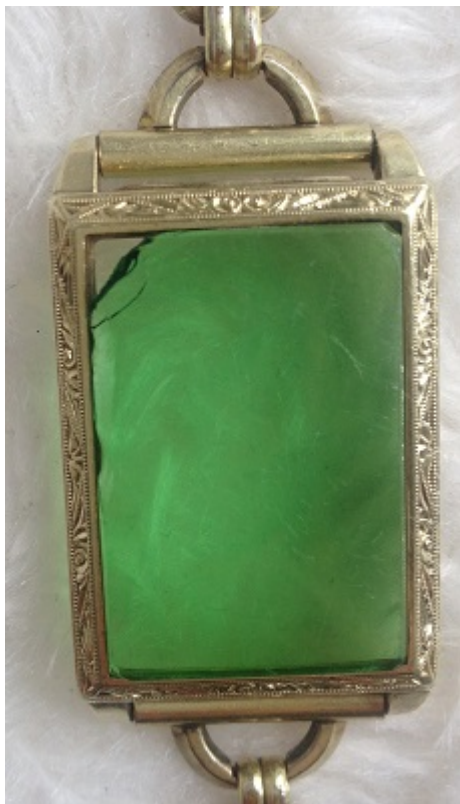
2) Quadron_case_side.jpg , downloaded 1652 times