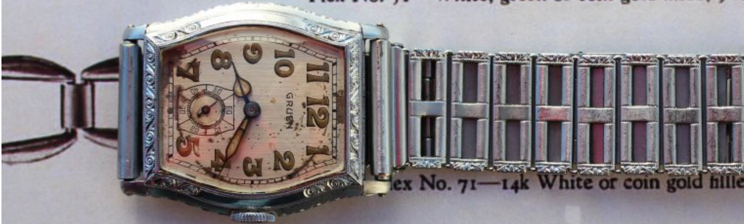
Flex No. 71—14k White or coin gold filled