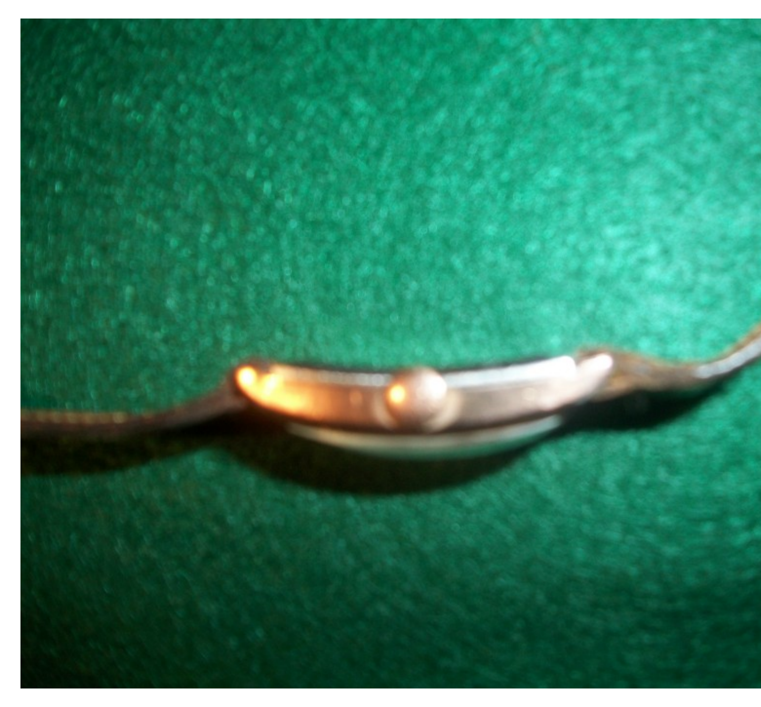
5) 100_0329c.jpg, downloaded 1785 times