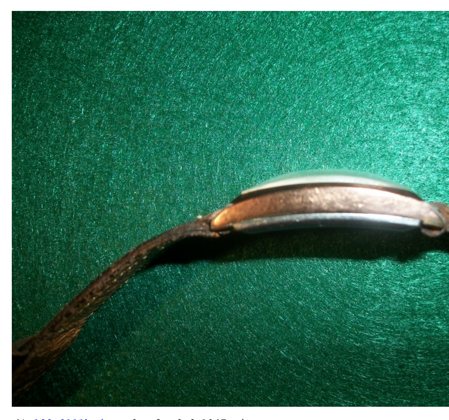
4) 100_0111b.jpg, downloaded 1947 times