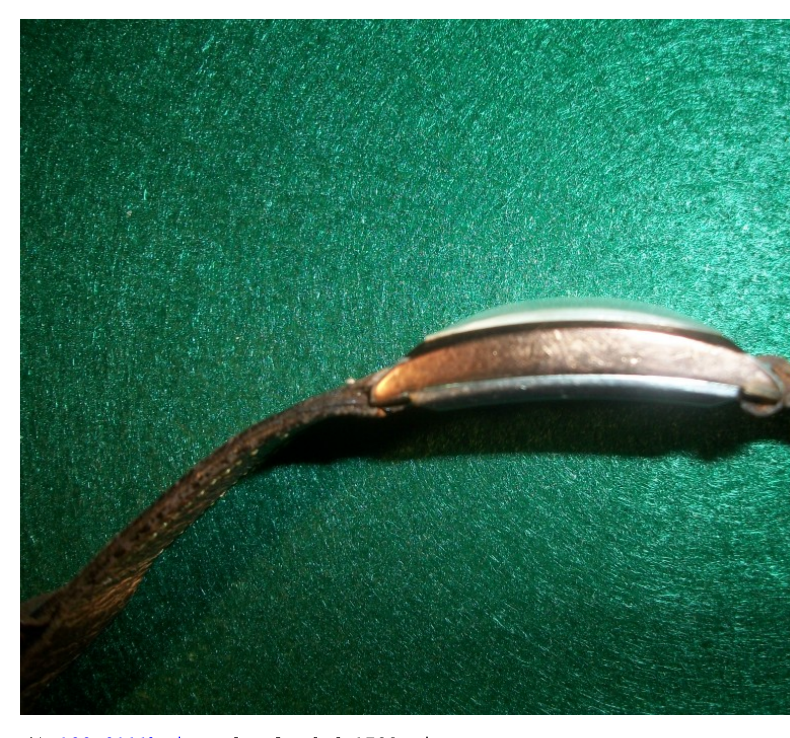
4) 100_0111b.jpg, downloaded 1783 times