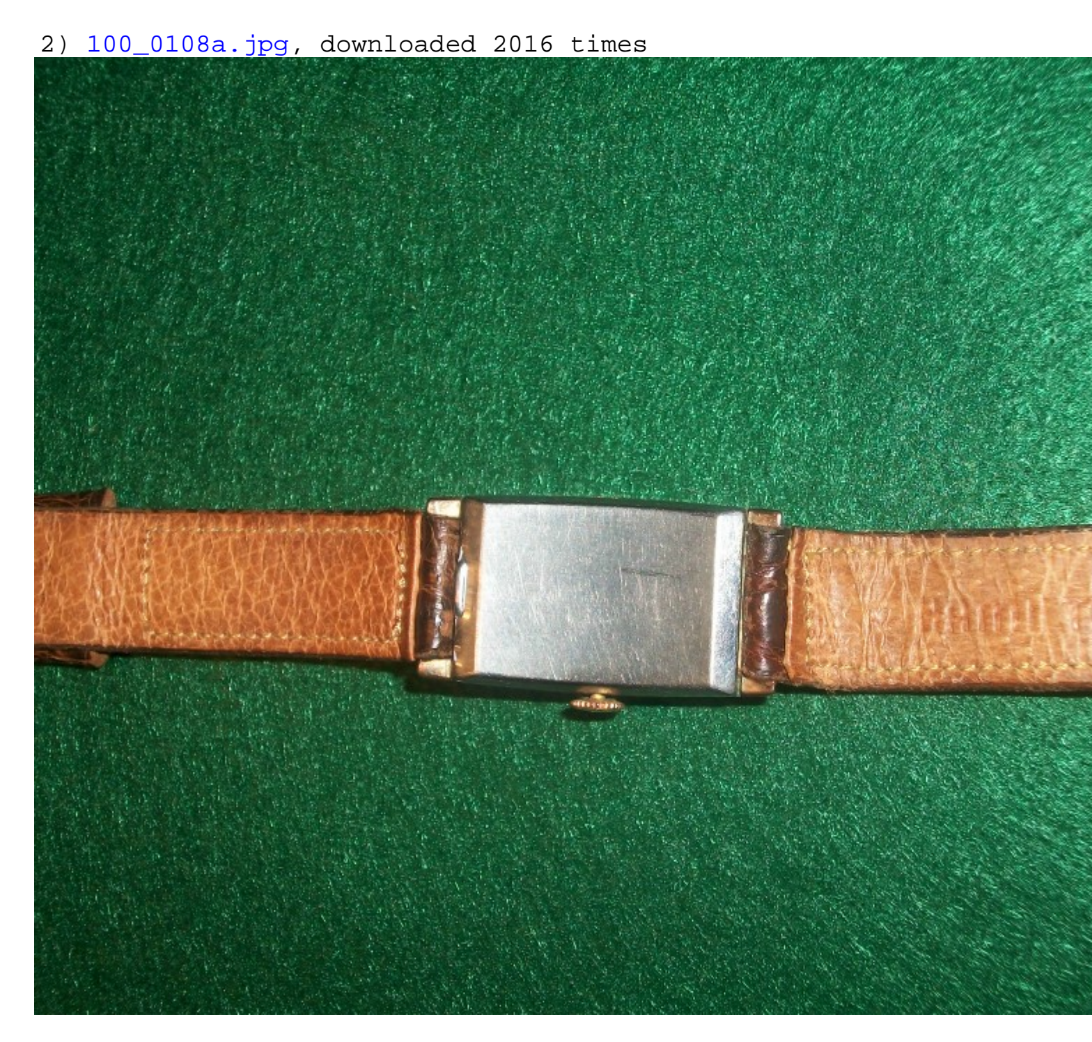
3) 100_0110a.jpg, downloaded 1978 times