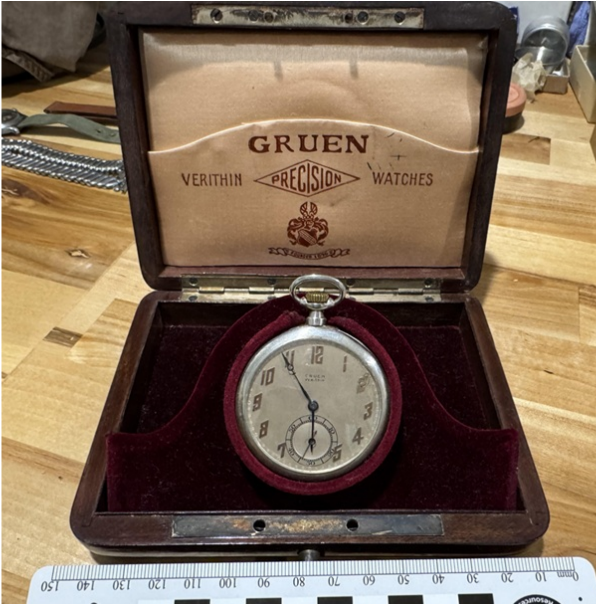
2) box_3_sm.jpg , downloaded 851 times