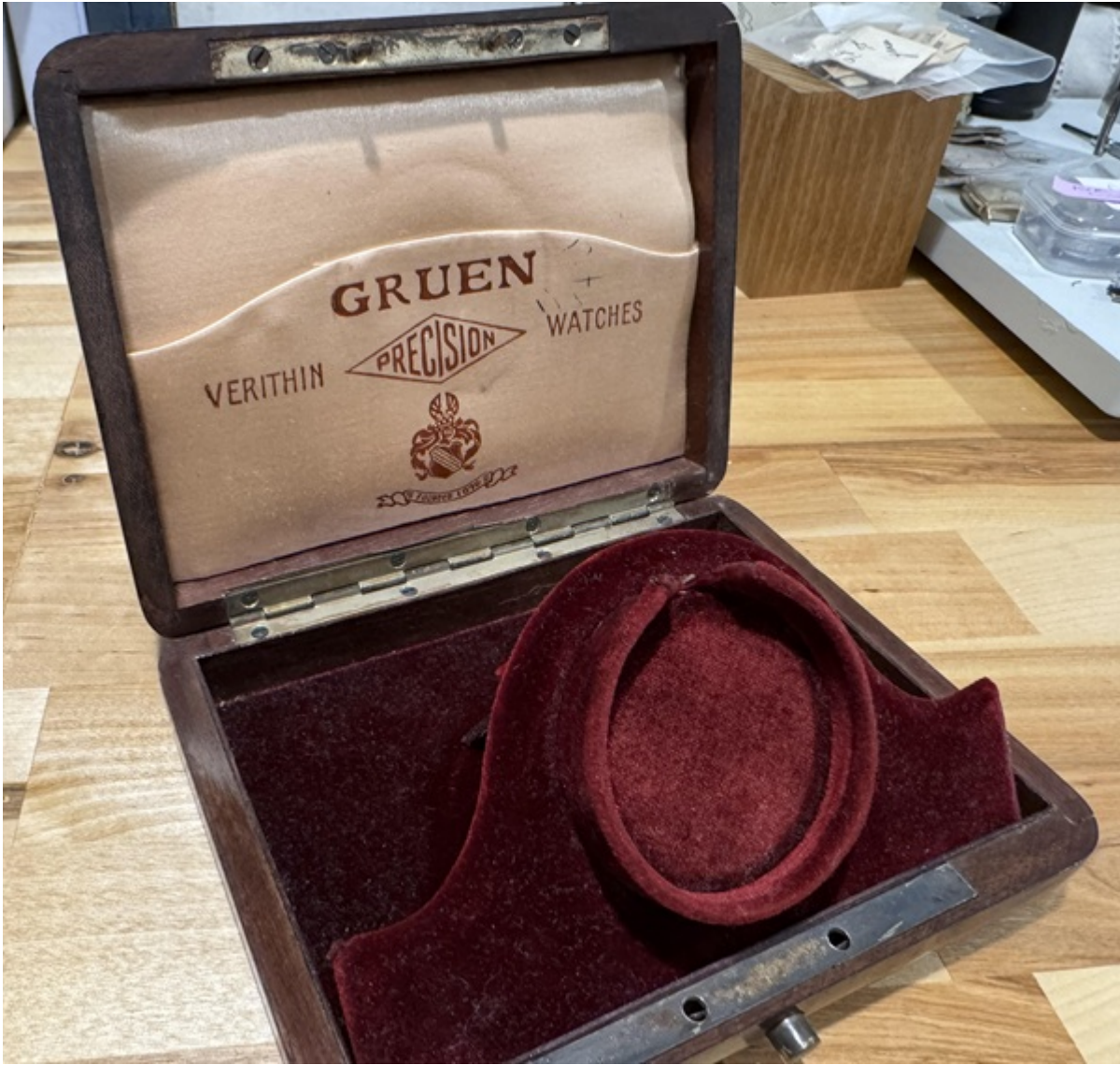
3) box_4_sm.jpg , downloaded 856 times