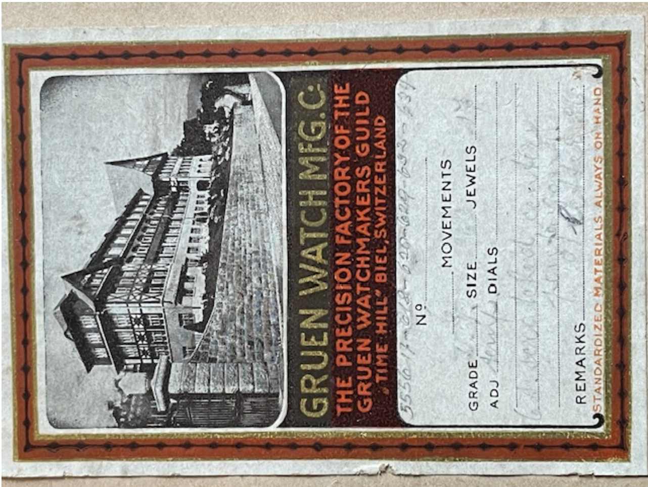
5) IMG_7869.JPG , downloaded 1677 times