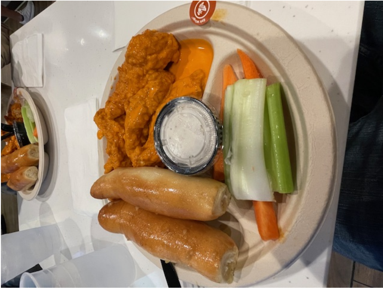
4) IMG_7810.JPG , downloaded 1384 times