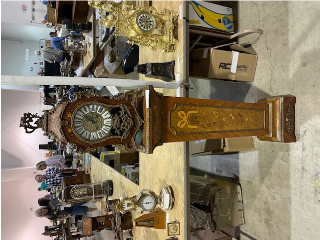
4) IMG_7933.JPG , downloaded 1196 times