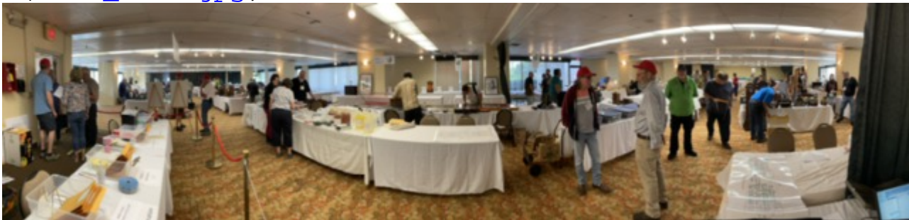
4) IMG_5848.jpg , downloaded 1733 times