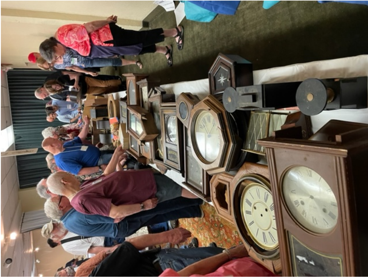
3) IMG_5847.jpg , downloaded 1763 times