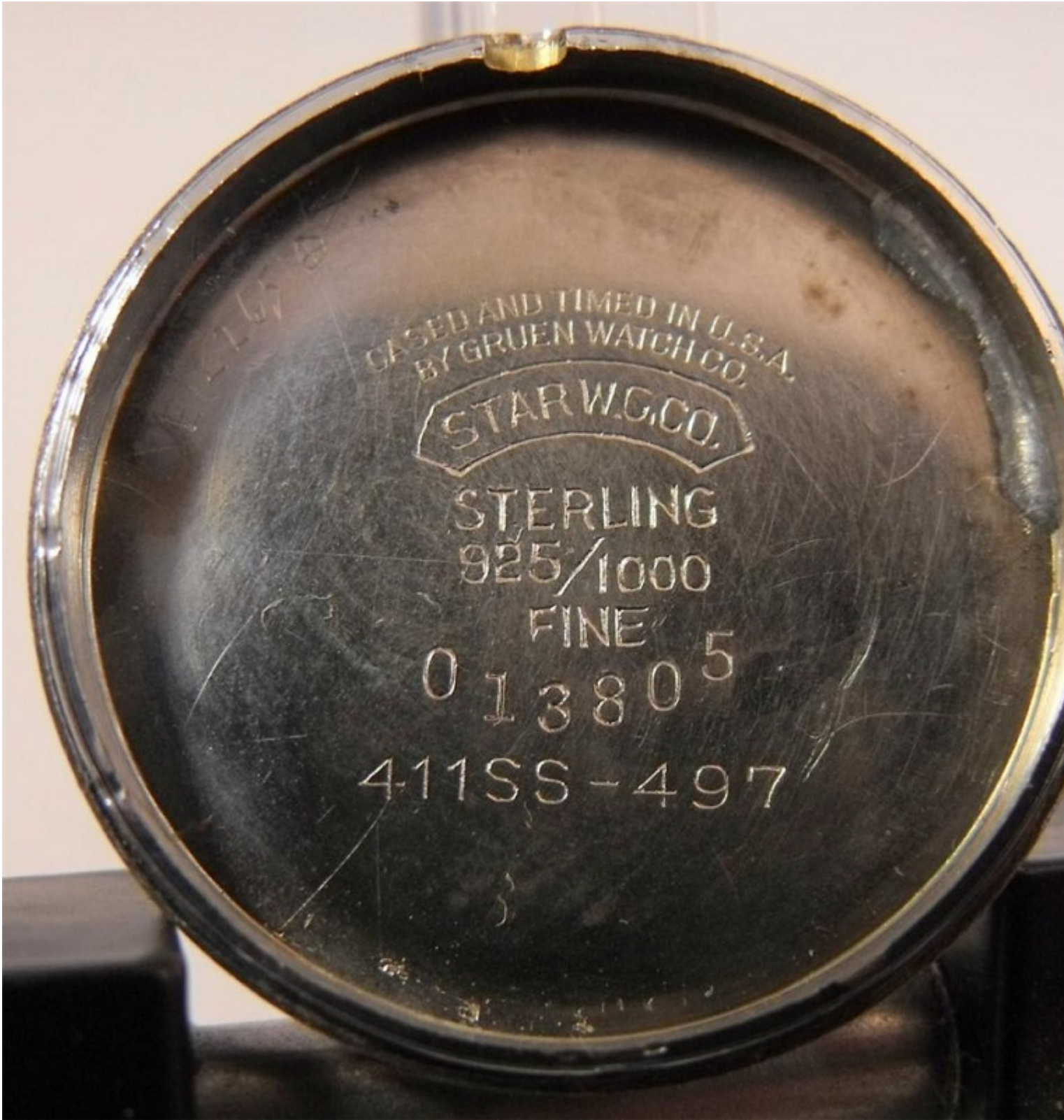
3) IMG_8762_sm.jpg , downloaded 2328 times