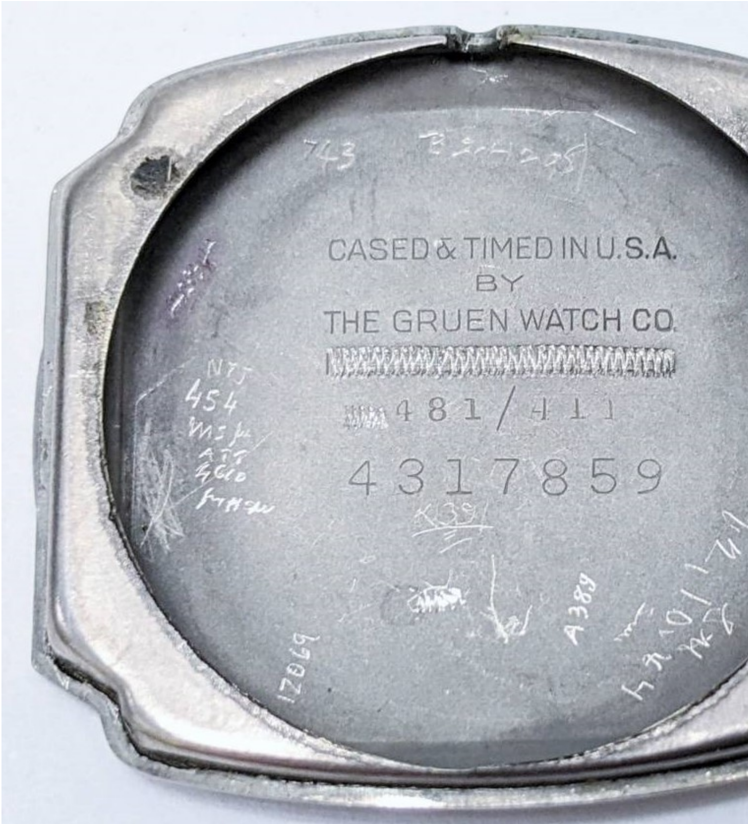
4) o1050207487_6.jpg , downloaded 2678 times