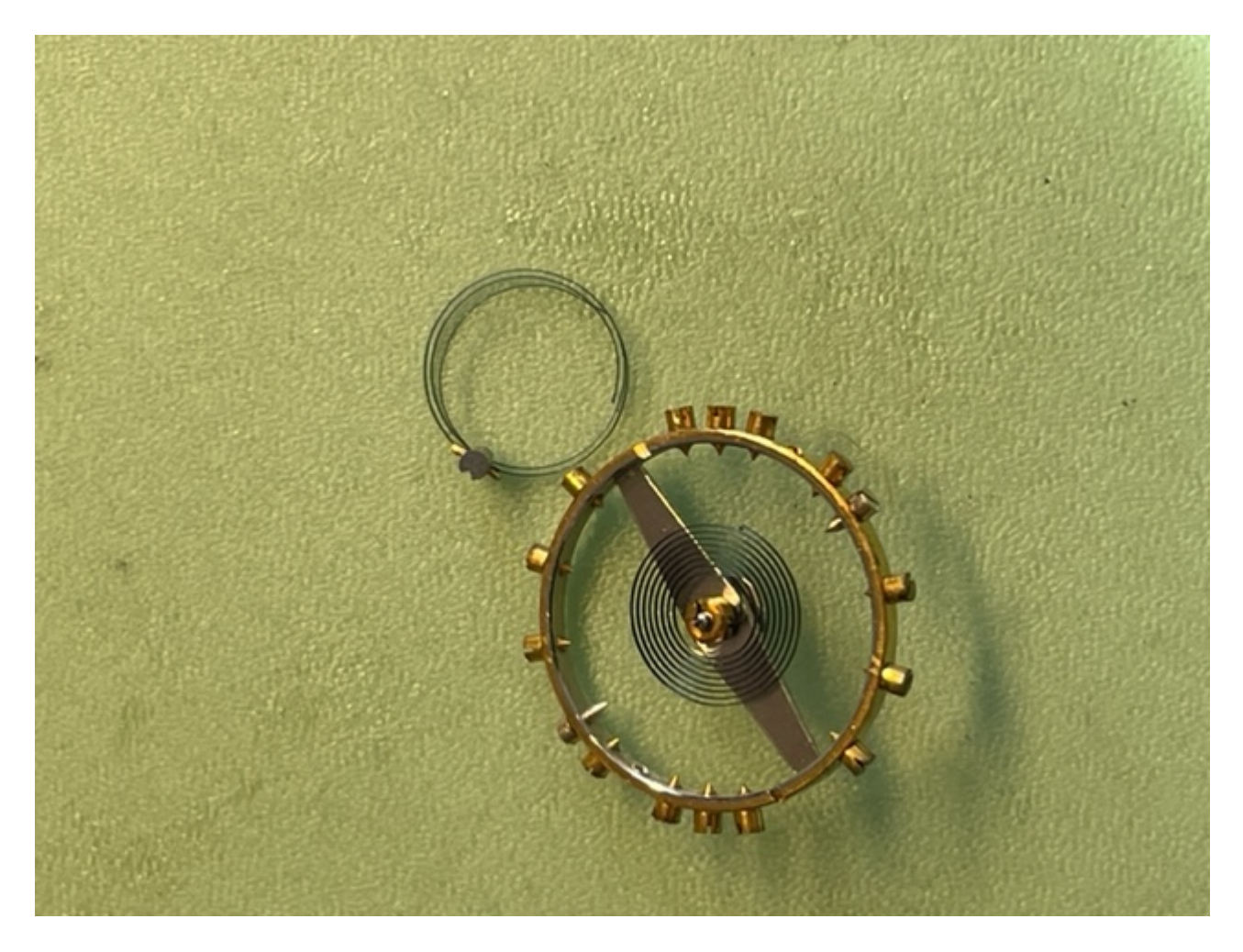
2) 707.jpg, downloaded 1629 times