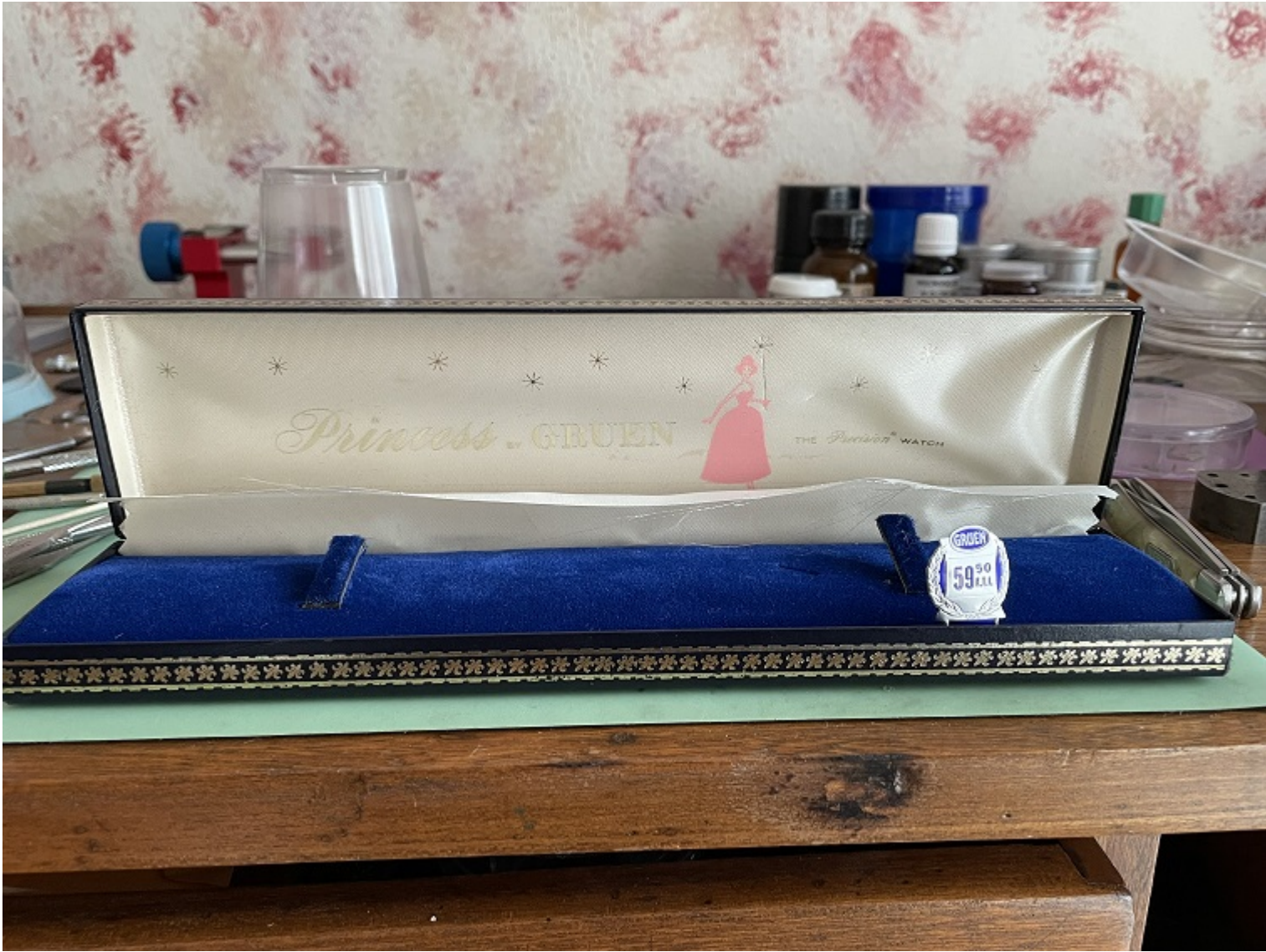
3) princess (3).JPG , downloaded 2624 times