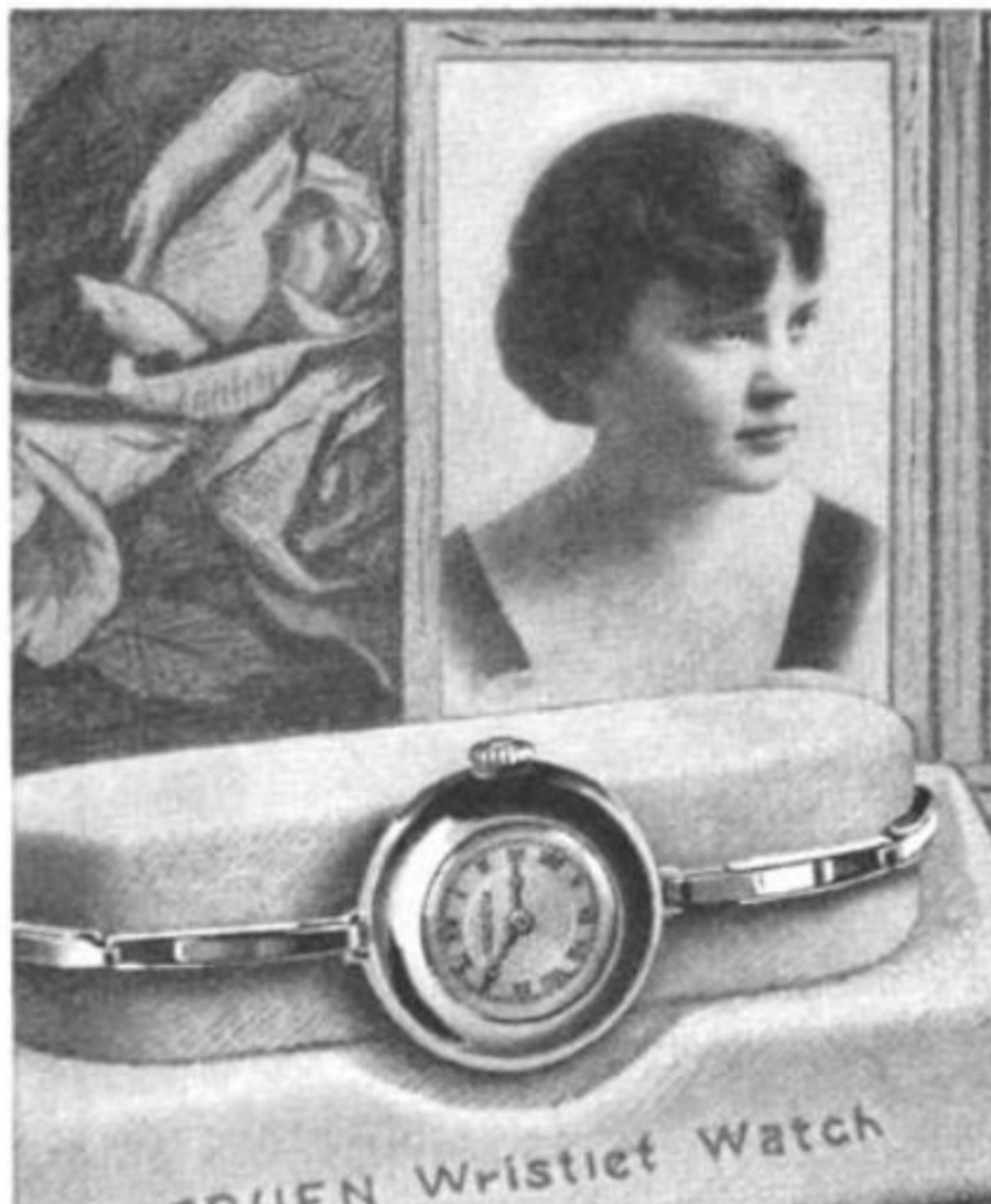
WOMEN Wristlet Watch