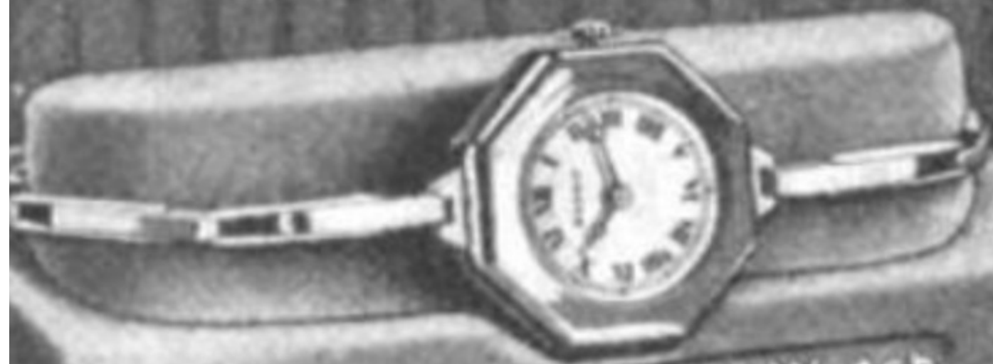
GRUEN Wristlet Watch