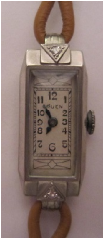
2) Bag 505 back small.jpg , downloaded 2340 times