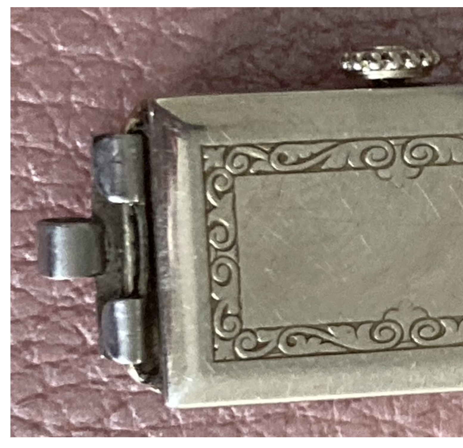
4) E45D6330-F2E2-4D97-A5F9-5CC5ABBF89BC.jpeg, downloaded 1885 times