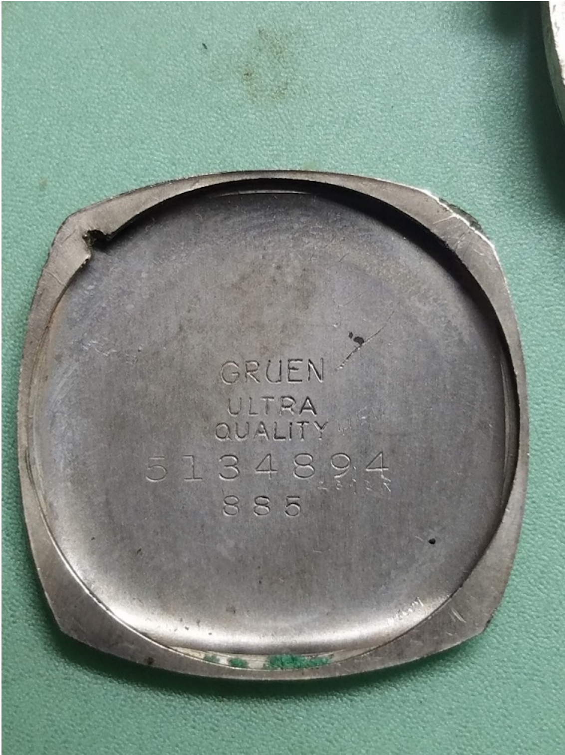
3) 885 (3).jpg , downloaded 2272 times