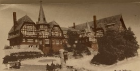
East View Gruen Workshops Time Hill . . Cincinnati

Incompetent watch repairers, of which there are thousands scattered around the country, do more damage in "repairing" good watches than the owners do through accident. Accidents will happen. Therefore, should your watch need repairing, for your own protection we advise that bargain price repairing be avoided, and it be taken, not to any jewelry store or watch "hospital" or repair shop, but preferably to the jeweler who sold it originally. If this is impractical, go to any jeweler who sells Gruen Watches and displays the Gruen Service Emblem. He has been selected because he maintains a competent, professional watch repair service.