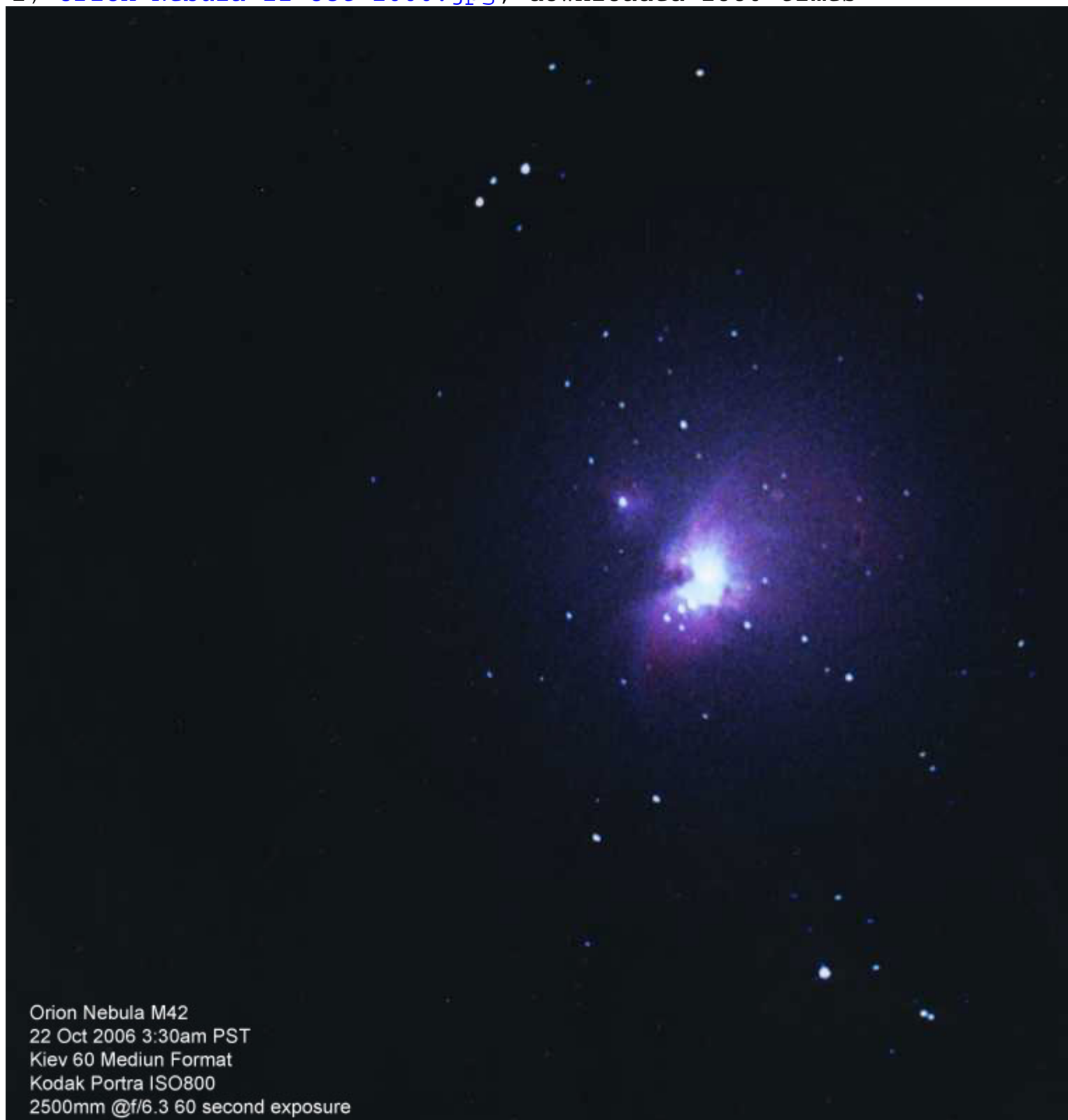
Orion Nebula M42 22 Oct 2006 3:30am PST Kiev 60 Mediun Format Kodak Portra ISO800 2500mm @f/6.3 60 second exposure

2) Orion Nebula 22 Oct 2006.jpg , downloaded 1880 times