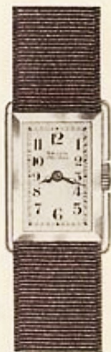
Car. 379—14k Solid white gold Crown- Guard case. 17 jewel PRECISION movement, $100