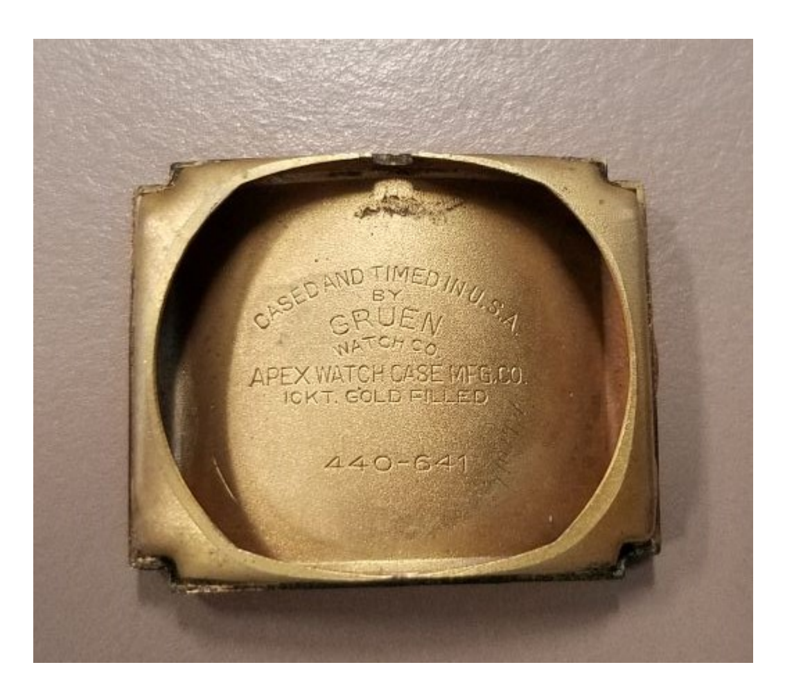
2) Front.jpg, downloaded 1545 times