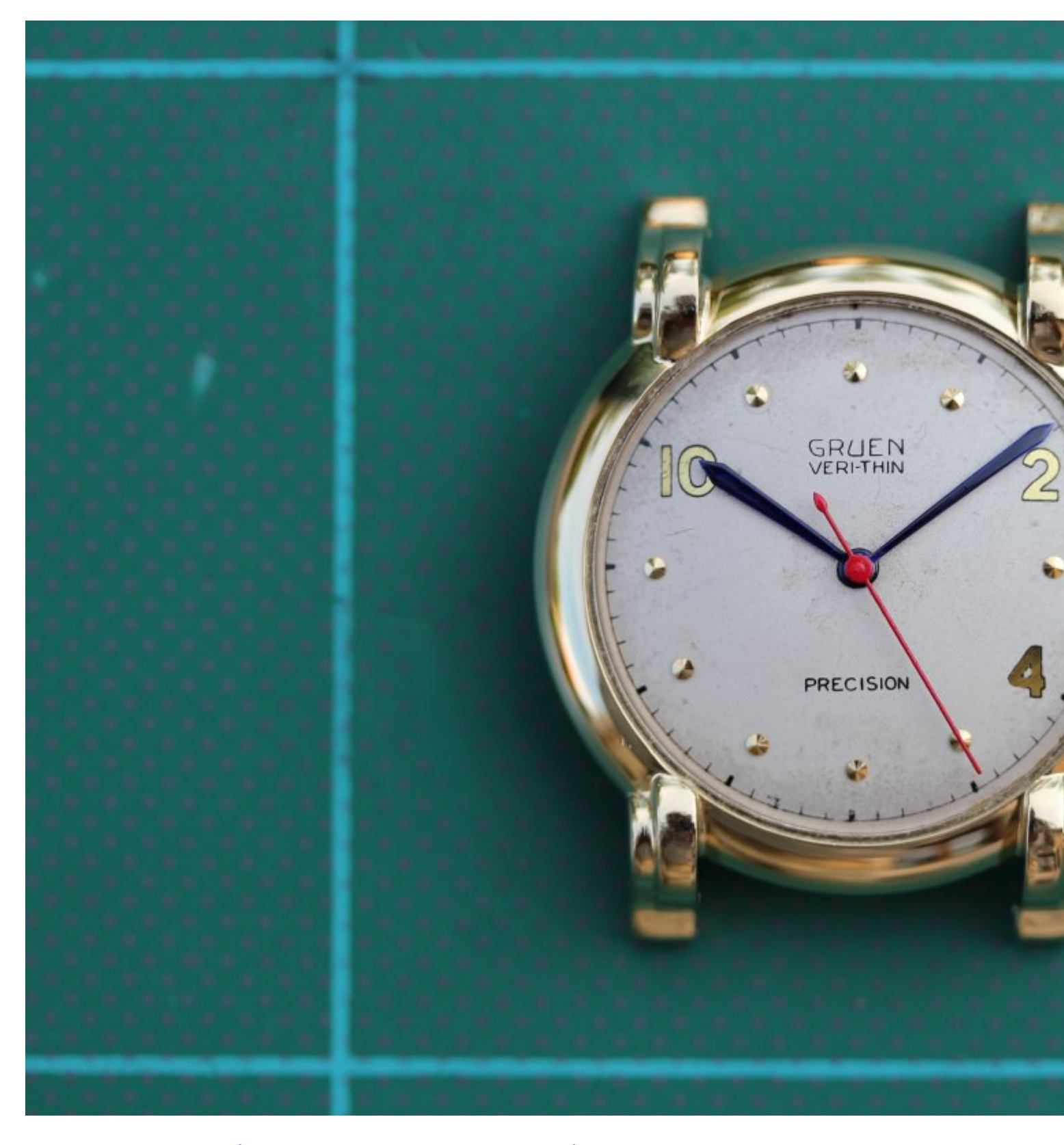
2) Img_0252b.jpg, downloaded 1732 times