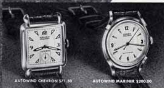
AUTOWIND CHEVRON $71.50