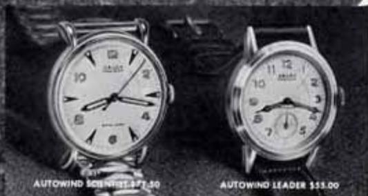
AUTOWIND SCIENTIST $71.50