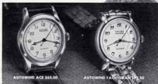
AUTOWIND ACE $65.00