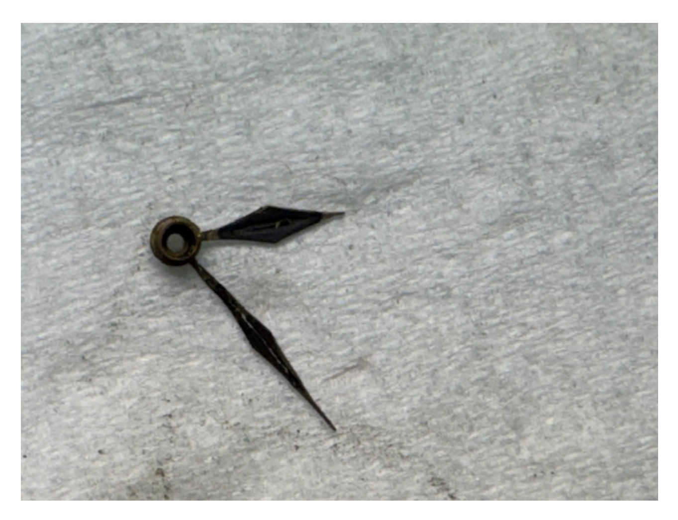
3) IMG_0083.jpg, downloaded 728 times