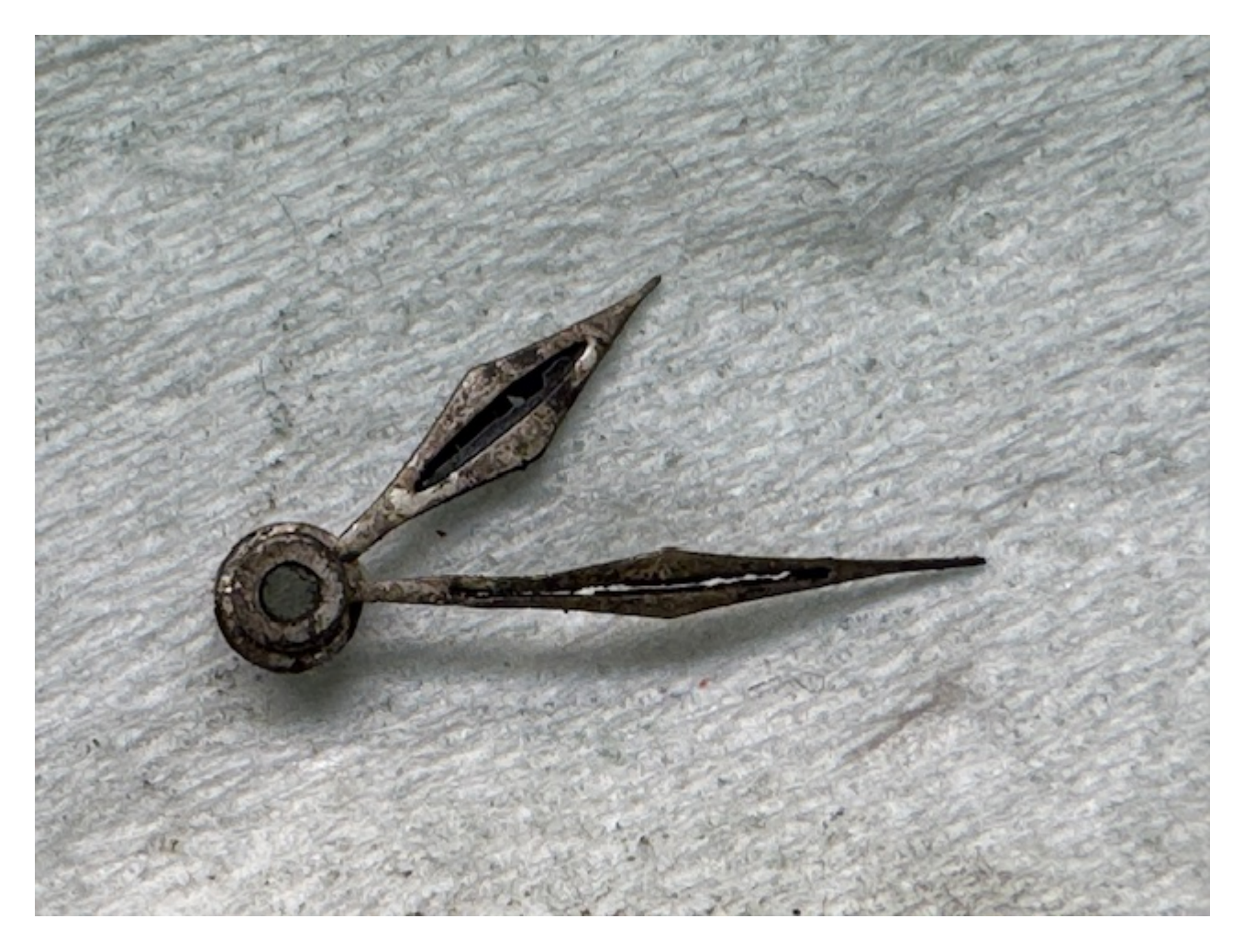
2) IMG_0082.jpg, downloaded 740 times