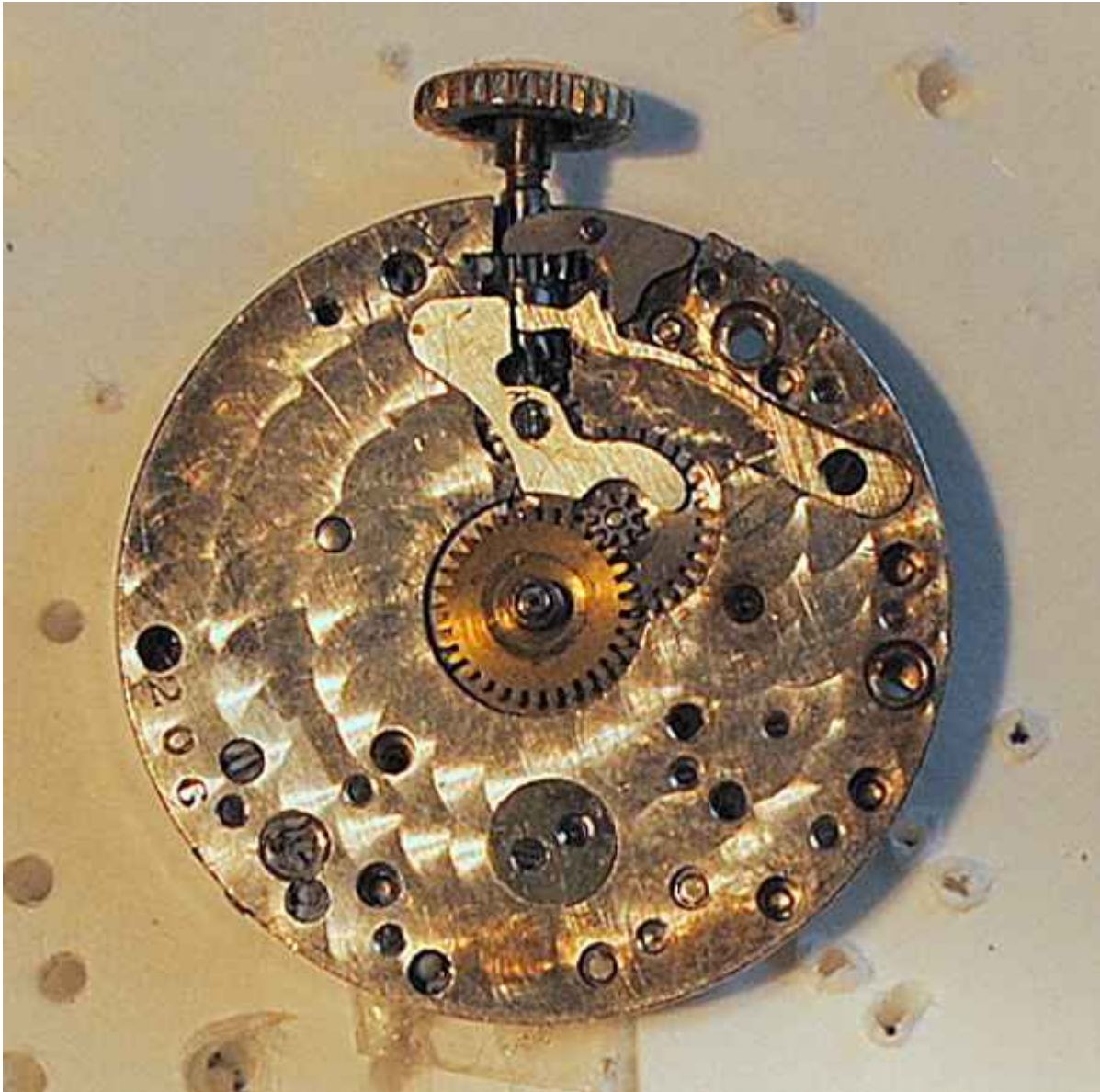
2) Gruen+179+movement+1.JPG , downloaded 2063 times