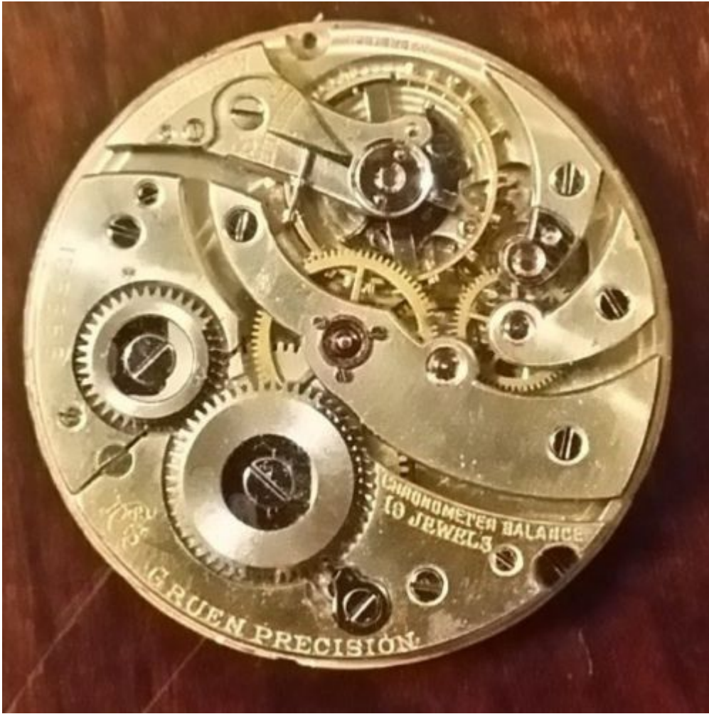
3) Gruen cal.V2 19j.jpg , downloaded 2029 times