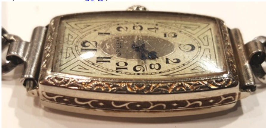
3) Dial.jpg , downloaded 2144 times