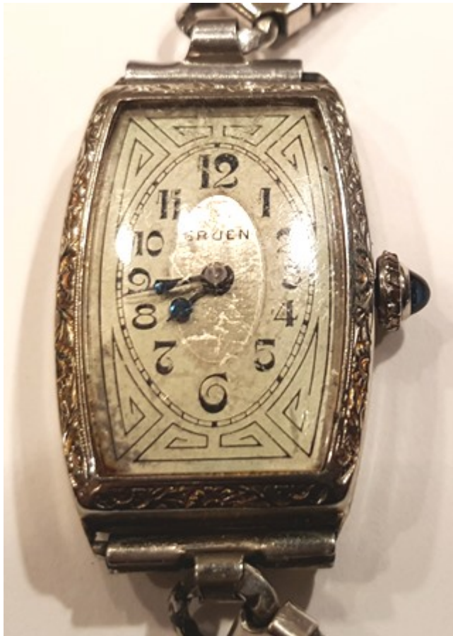
2) CaseSide.jpg , downloaded 2120 times