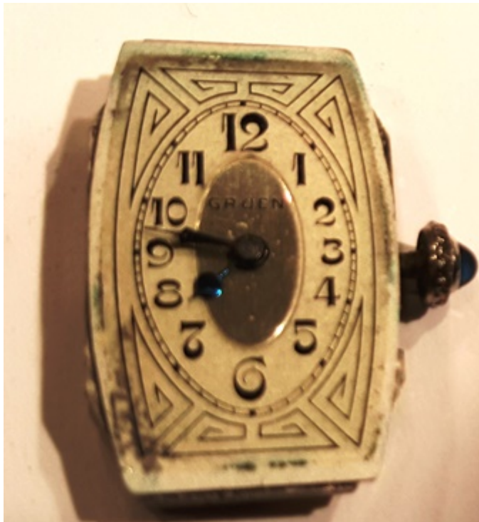
4) InsideCase.jpg , downloaded 2129 times