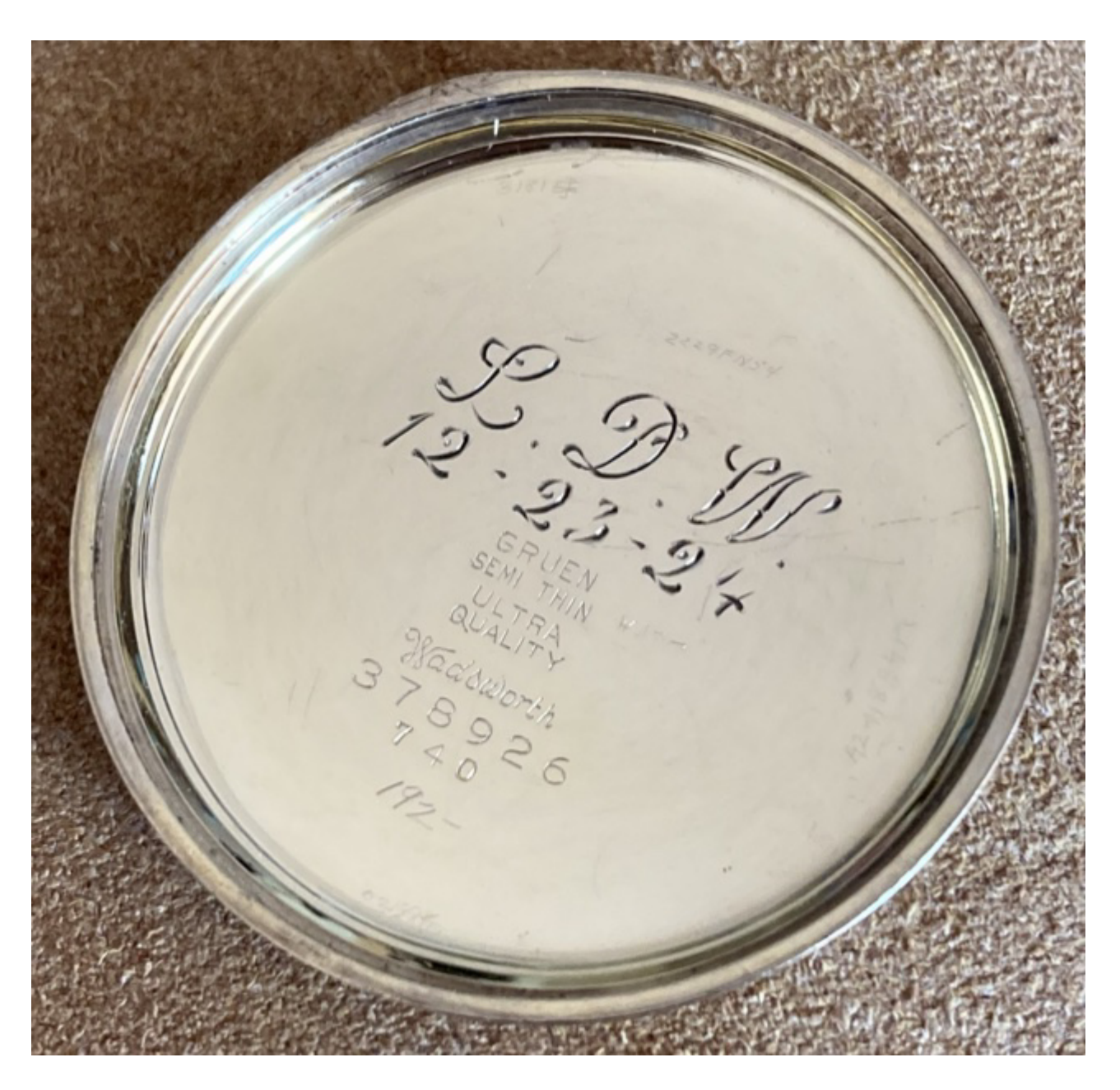
4) F70EB101-FE04-49B3-B33B-8674686BC20B.jpeg, downloaded 1530 times