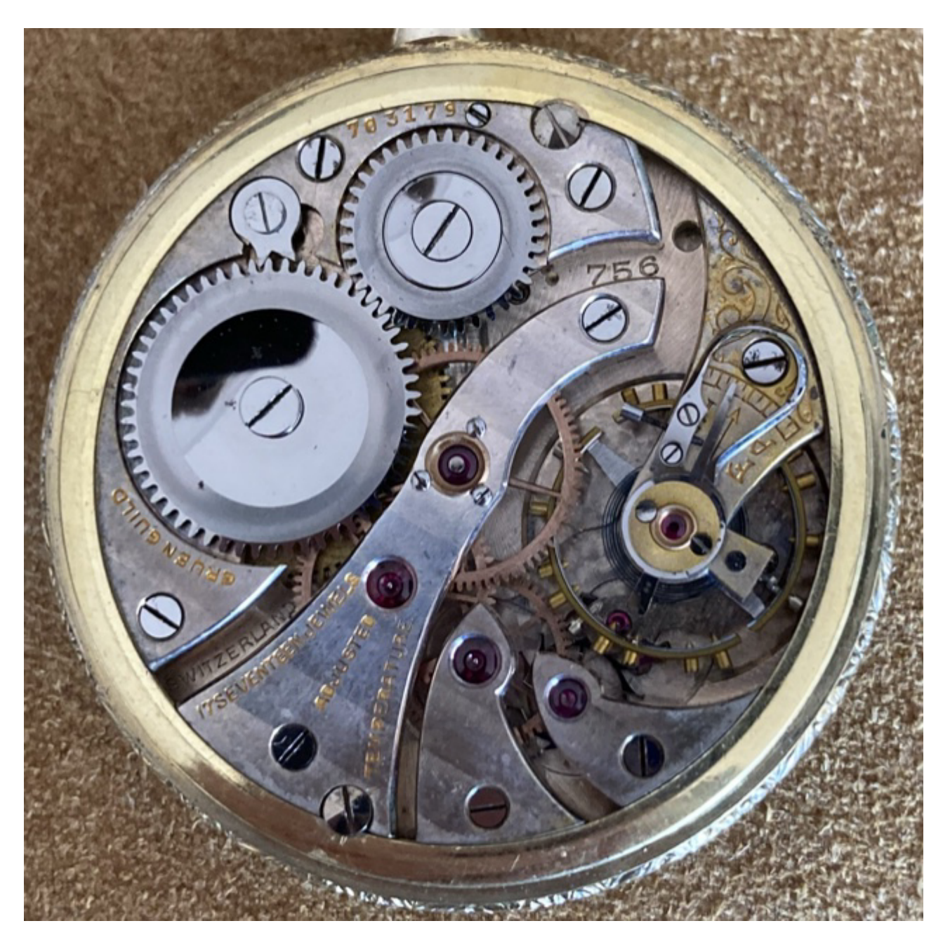
3) 1E35F758-C504-4CEA-9A88-749C6F479B11.jpeg, downloaded 1549 times