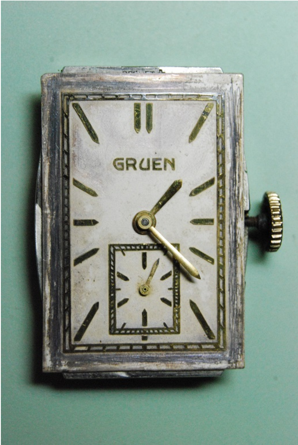
4) inside_157.jpg , downloaded 2603 times