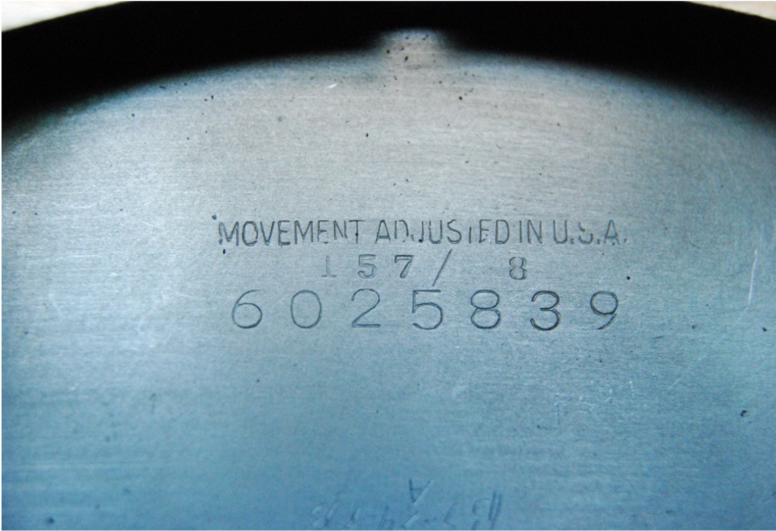
5) movement_157.jpg , downloaded 2576 times