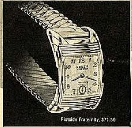
Ristside Fraternity, $71.50

Now... the first major advance in watchmaking design since the introduction of the wristwatch. Curvex Ristside, exclusive with Gruen ... functionally designed to be worn on the side of your wrist, with the dial in a direct line of vision. No wrist-twist, no wrist-fumble when you want to see the correct time. It hugs the wrist comfortably and won't slide from side to side. The movement is curved to fit the curve of the case, utilizing every fraction of space to permit large sturdy parts... so essential for brilliant accuracy. Only the patented Gruen Curvex movement makes this possible. Gruen is the official timepiece of TWA—Trans World Airline. The Gruen Watch Company, Time Hill, Cincinnati 6, Ohio, U.S.A. In Canada: Toronto, Ontario.