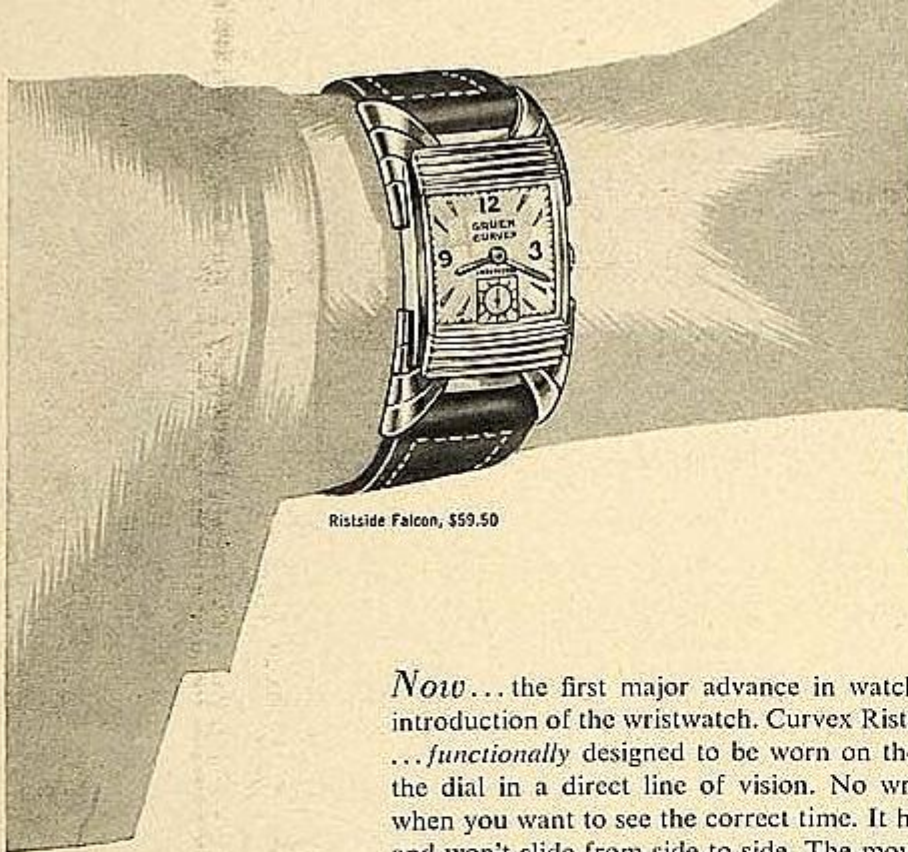
Ristside Falcon, $59.50