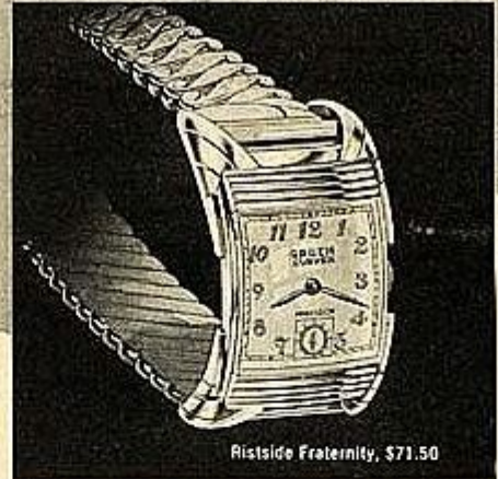
Ristside Fraternity, $71.50

Now... the first major advance in watchmaking design since the introduction of the wristwatch. Curvex Ristside, exclusive with Gruen ... functionally designed to be worn on the side of your wrist, with the dial in a direct line of vision. No wrist-twist, no wrist-fumble when you want to see the correct time. It hugs the wrist comfortably and won't slide from side to side. The movement is curved to fit the curve of the case, utilizing every fraction of space to permit large sturdy parts...so essential for brilliant accuracy. Only the patented Gruen Curvex movement makes this possible. Gruen is the official timepiece of TWA—Trans World Airline. The Gruen Watch Company, Time Hill, Cincinnati 6, Ohio, U.S.A. In Canada: Toronto, Ontario.