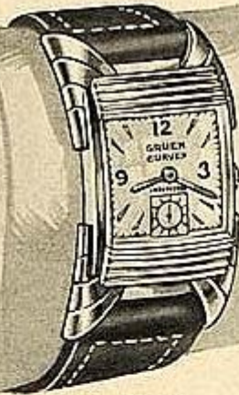
Ristside Falcon, $59.50