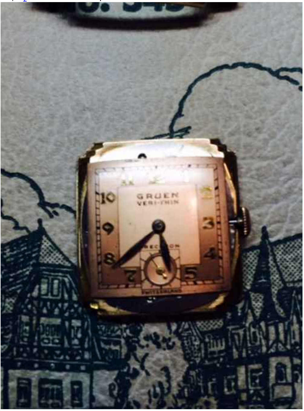
5) photo 4.JPG, downloaded 2163 times