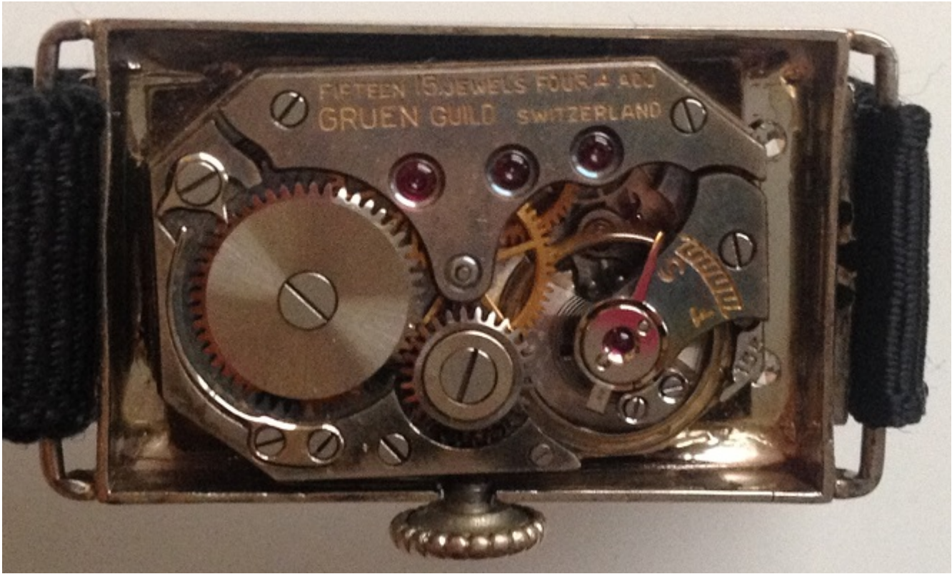
4) Car 255 Back.jpg , downloaded 2439 times