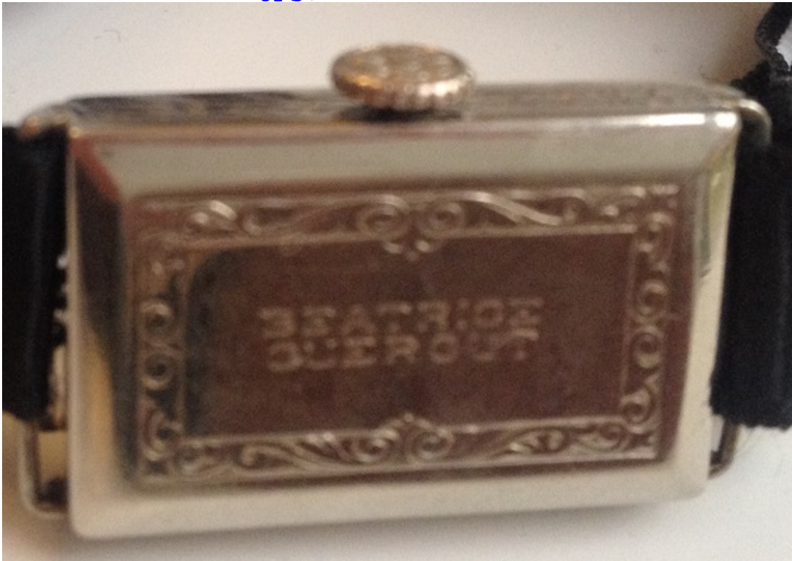
5) Car 255 Side.jpg , downloaded 2442 times