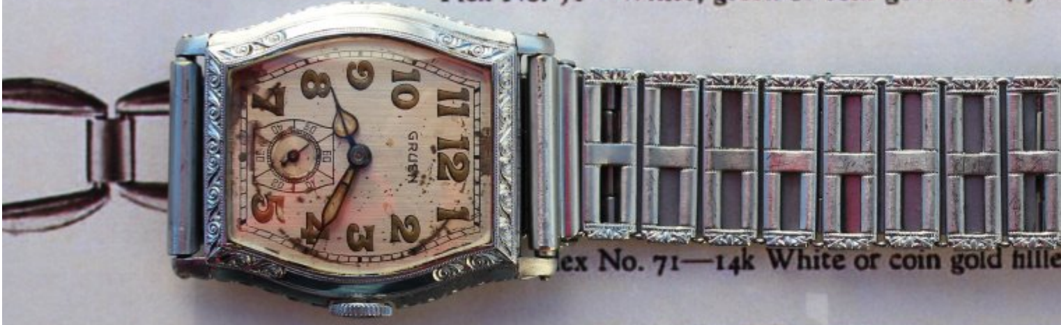
Flex No. 71—14k White or coin gold filled