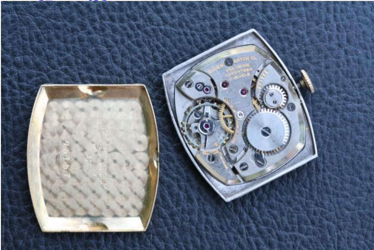
3) Gruen 1942 sales catalog SUTTON.jpg , downloaded 2243 times