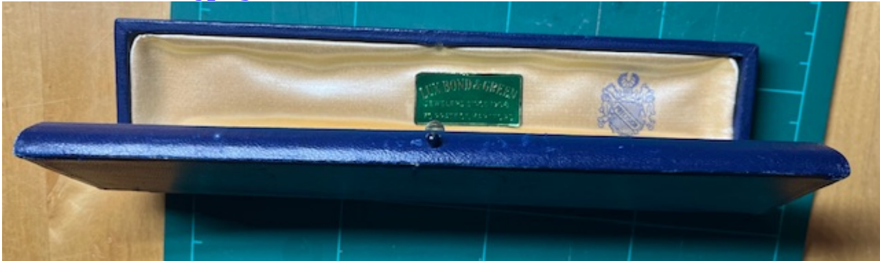
4) IMG_7784.jpeg , downloaded 799 times