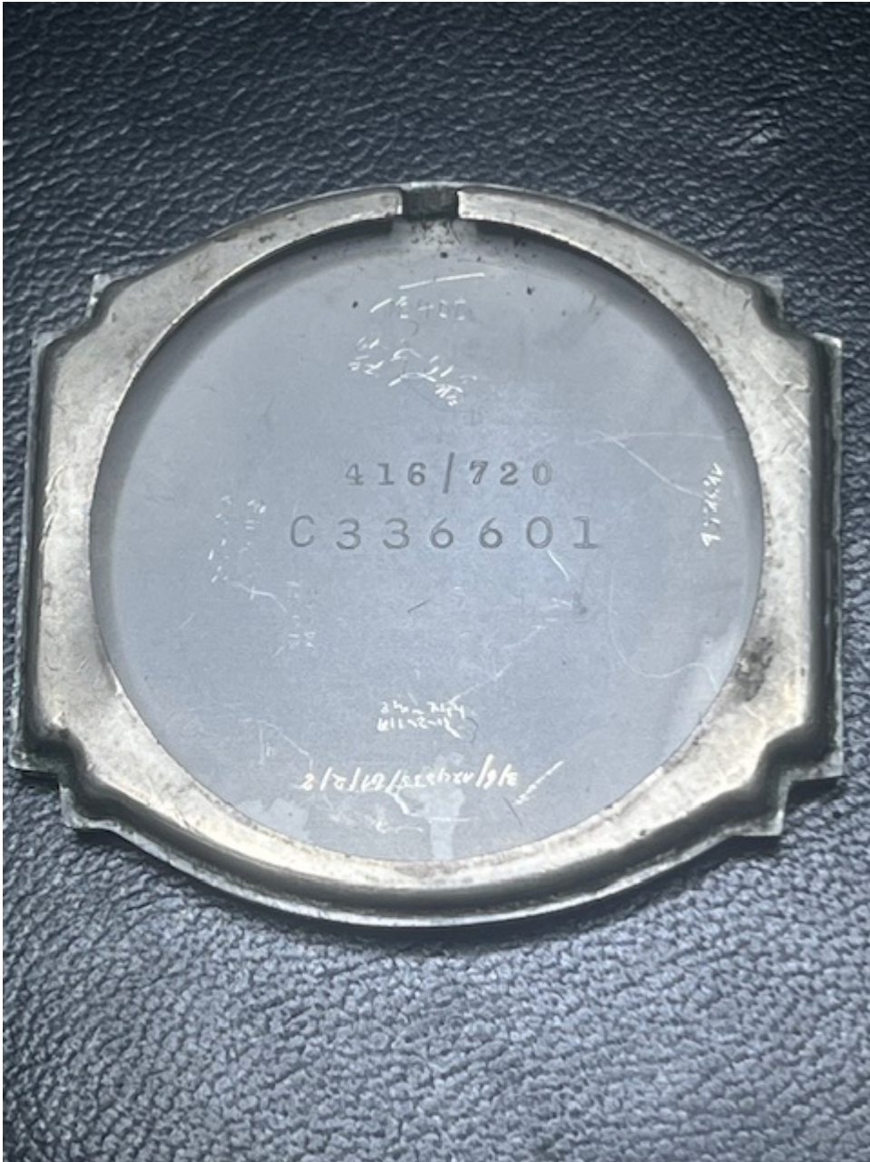
2) IMG_7701.jpeg , downloaded 885 times