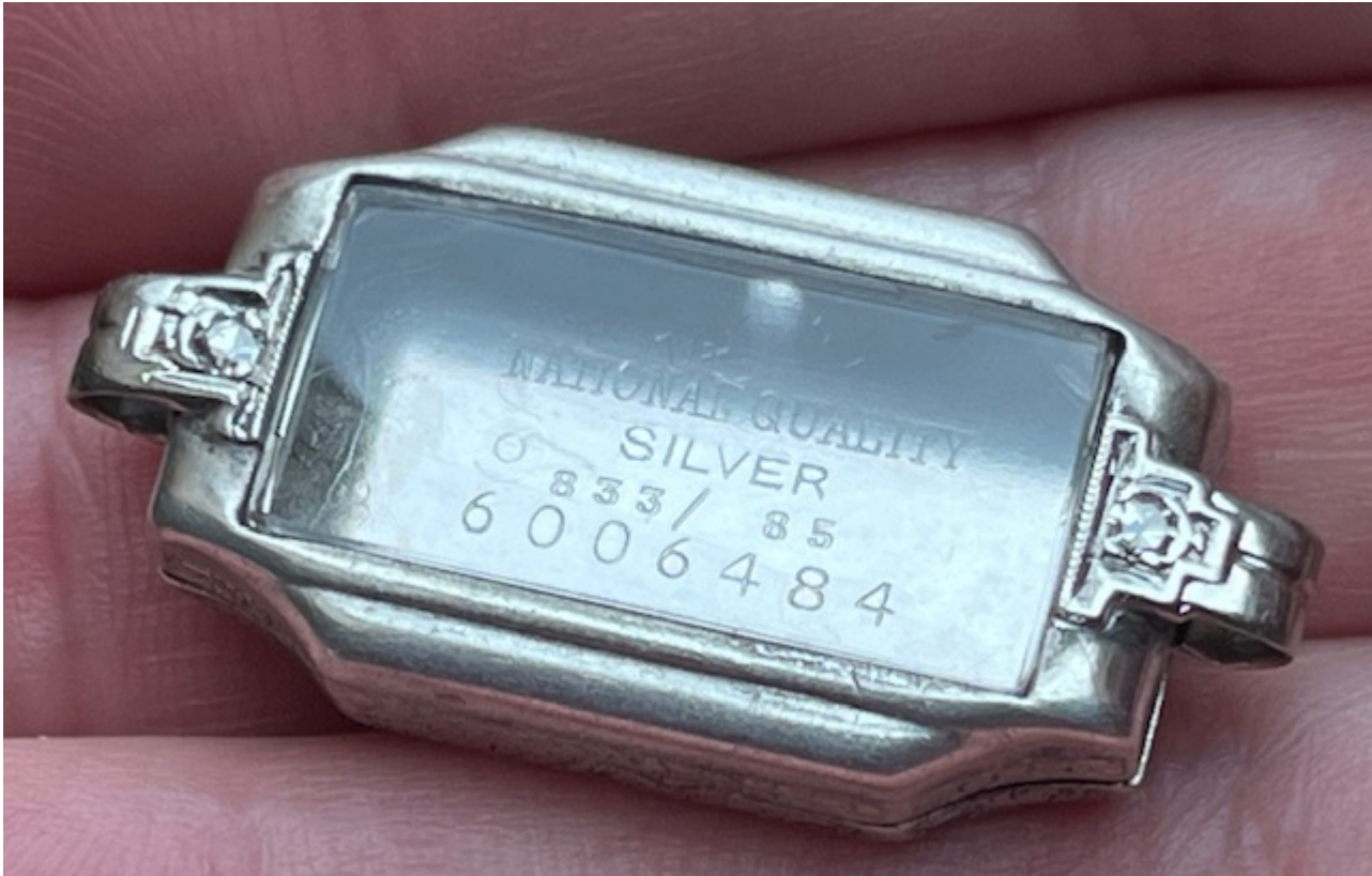
3) IMG_5085.jpeg , downloaded 1584 times