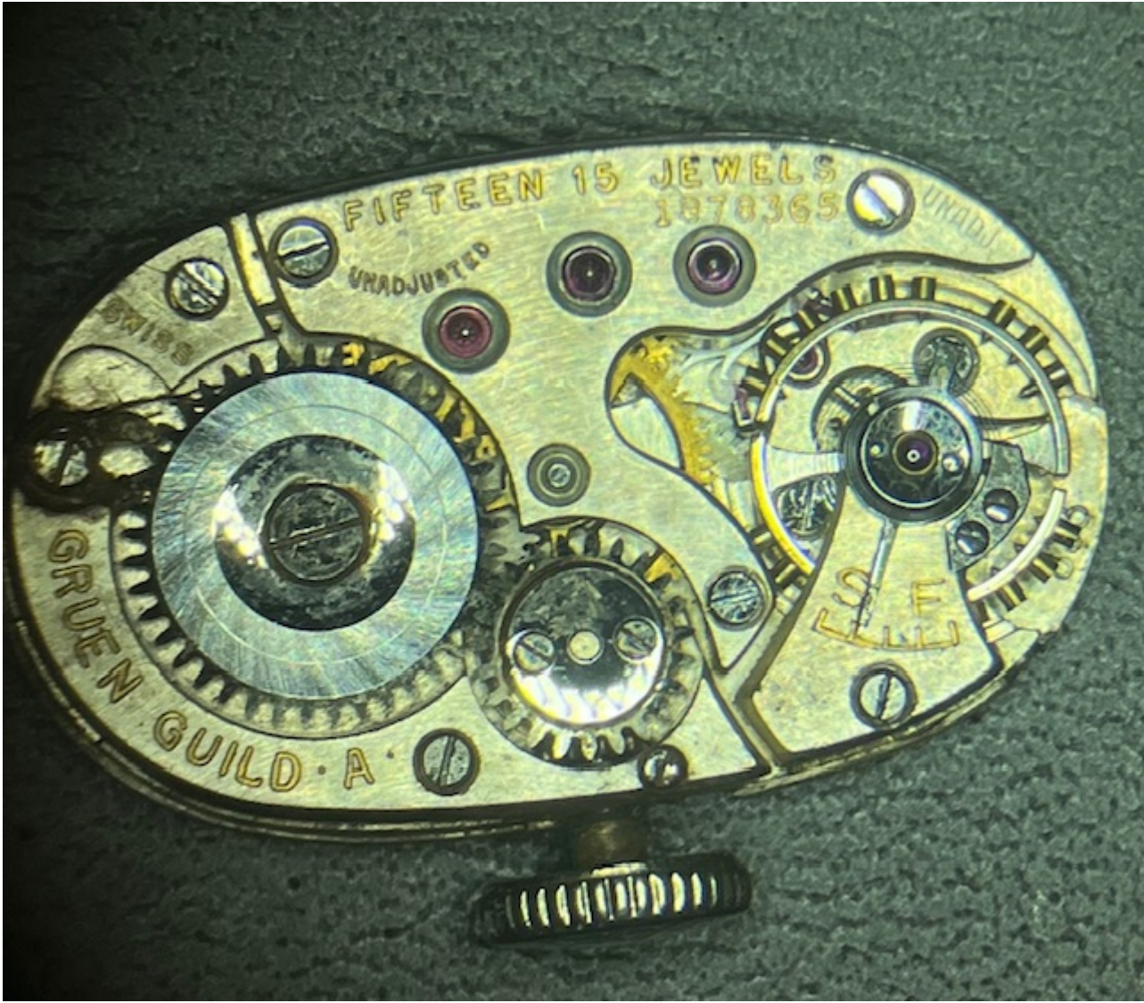
5) IMG_9387.jpeg , downloaded 1590 times