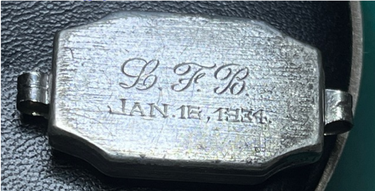
4) IMG_5076.jpeg , downloaded 1598 times