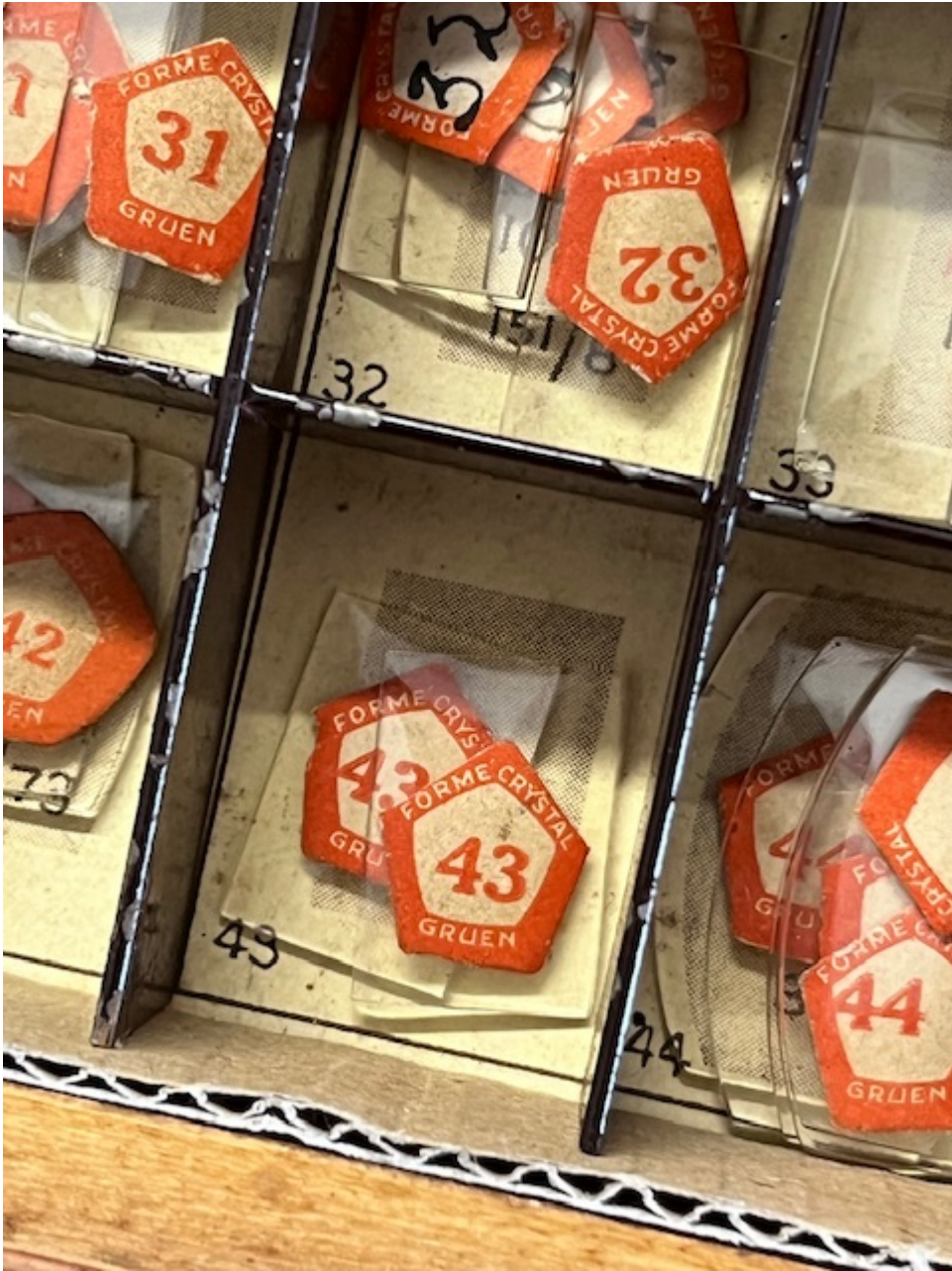
2) IMG_2084.jpeg , downloaded 1696 times