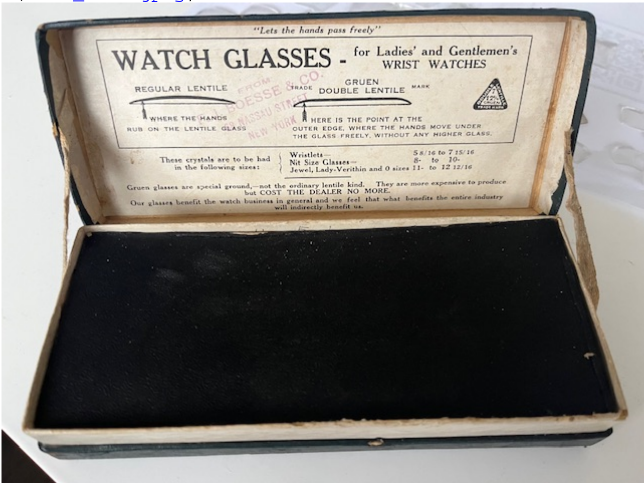
4) IMG_0946.jpeg , downloaded 2714 times