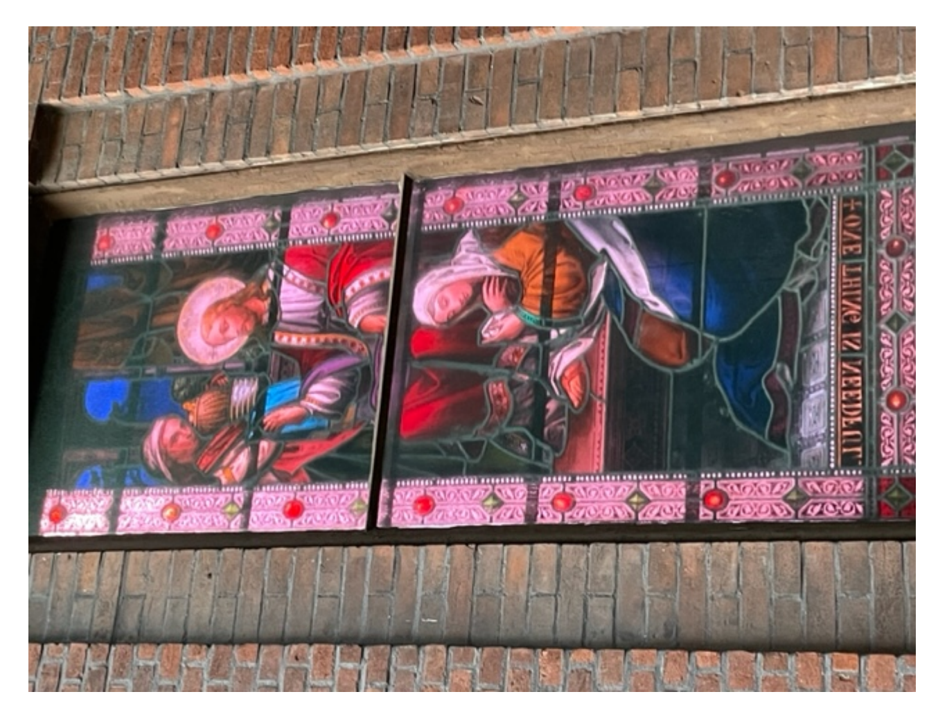
3) IMG_6013.jpg, downloaded 1233 times