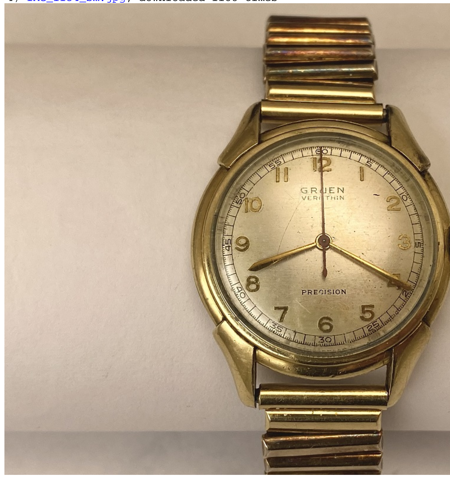
5) IMG_1135_sm.jpg, downloaded 1191 times

4) IMG_1134_sm.jpg, downloaded 1188 times