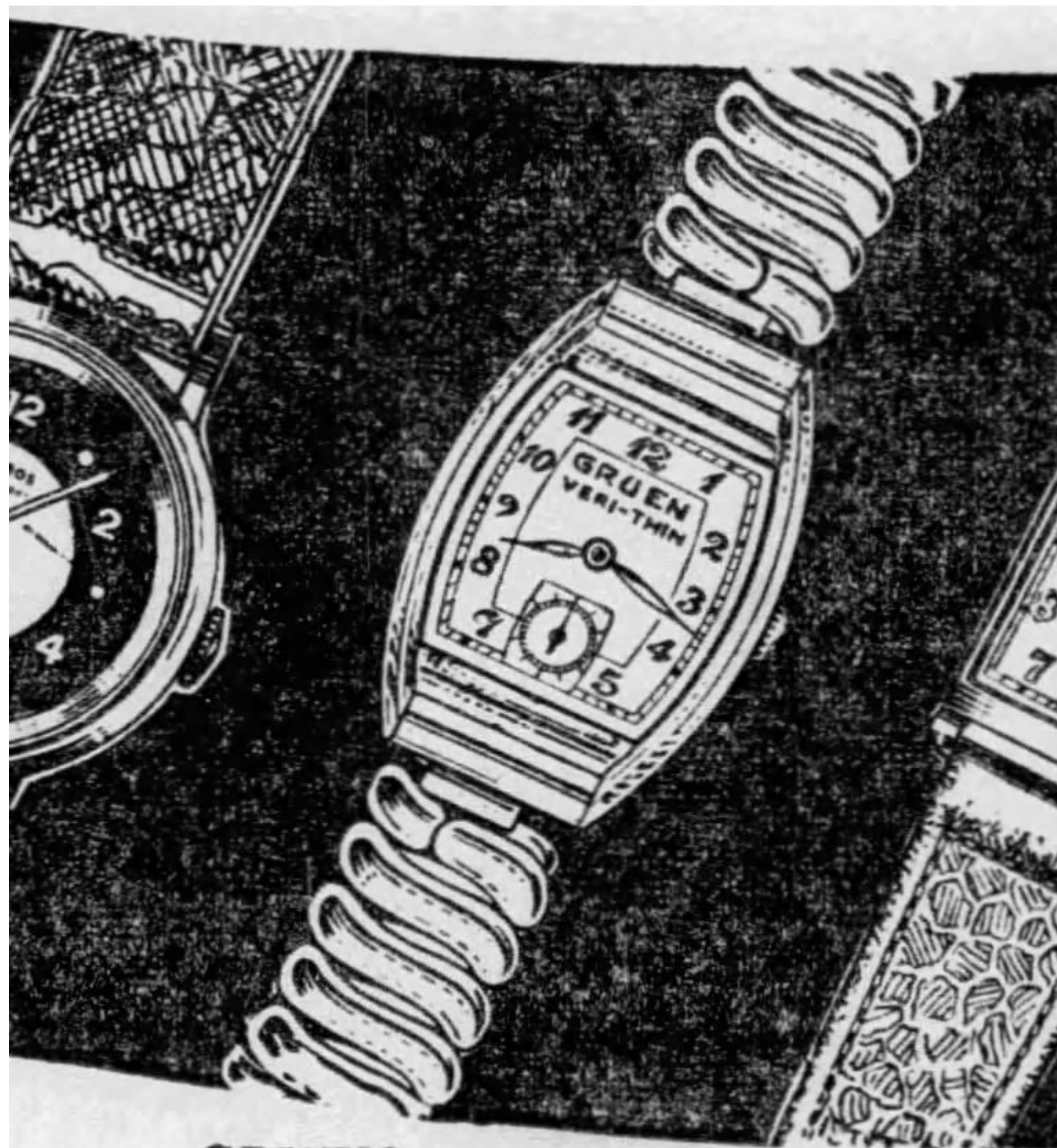
GRUEN Veri-Thin, 17 Jewels, expansion band $49.75