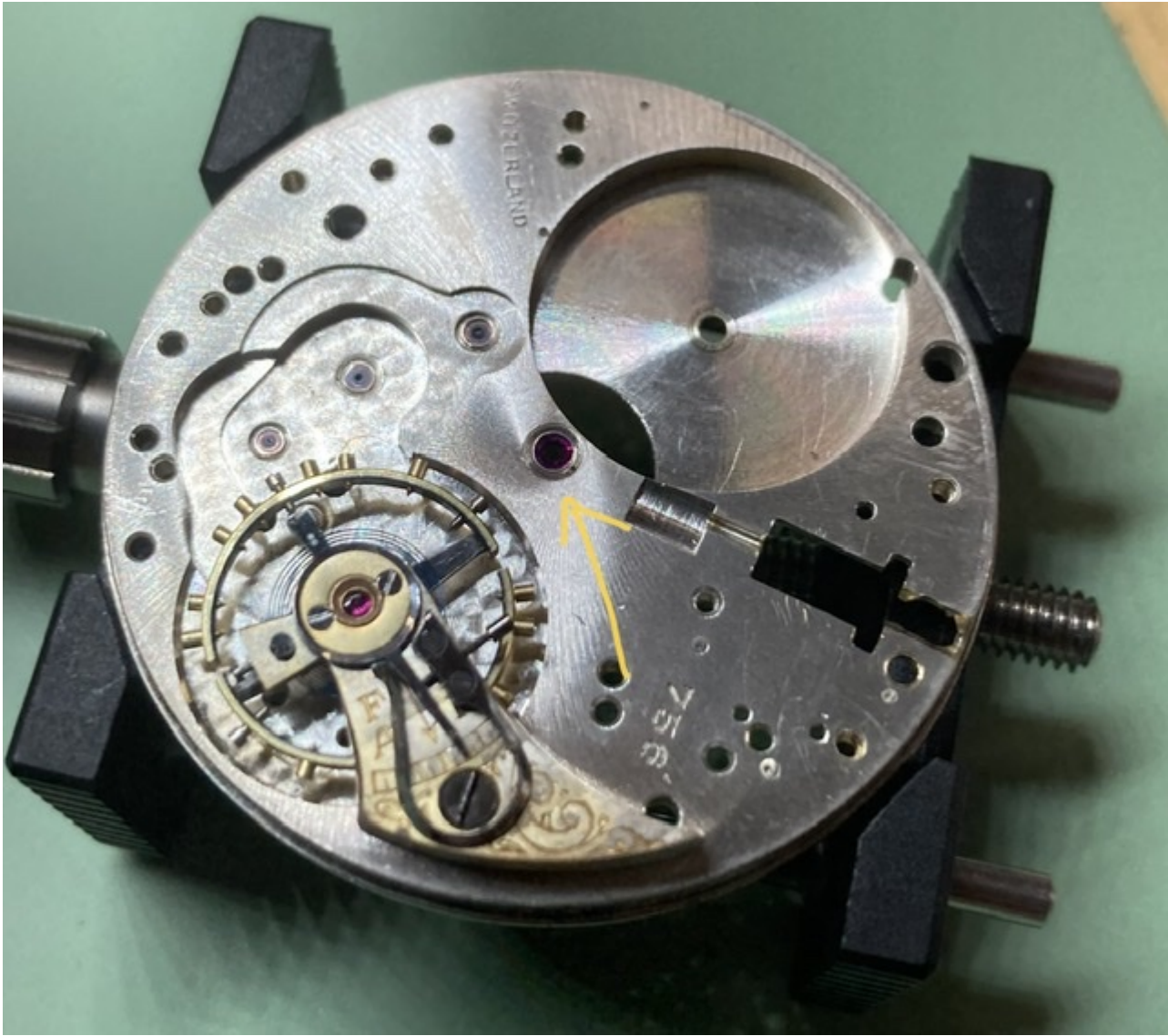
2) 02EDCC4A-4059-4C48-8B7E-CA82C9B67861.jpeg , downloaded 2284 times