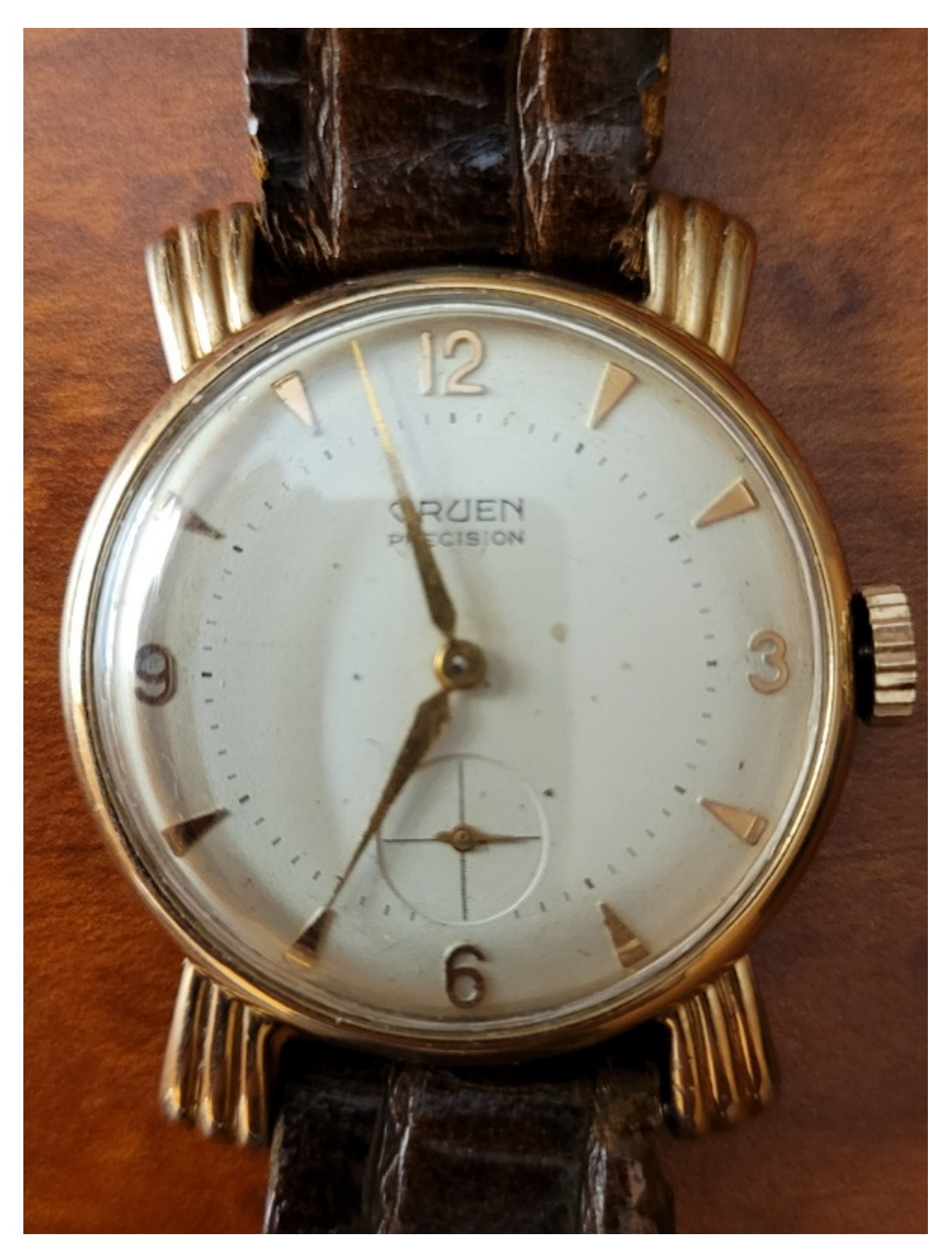
5) 2021 Reg (5).jpg, downloaded 2154 times