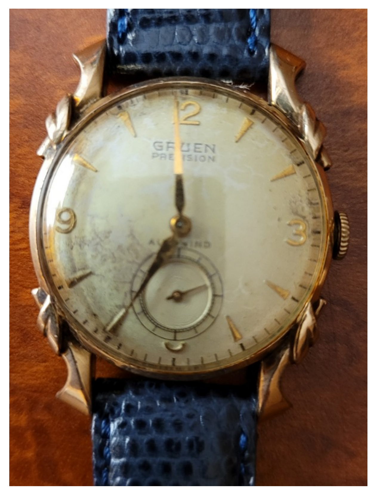
4) 2021 Reg (4).jpg, downloaded 2071 times