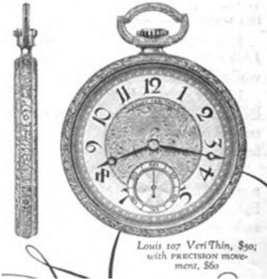
Louis 107 VeriThin, $50; with precision movement, $60