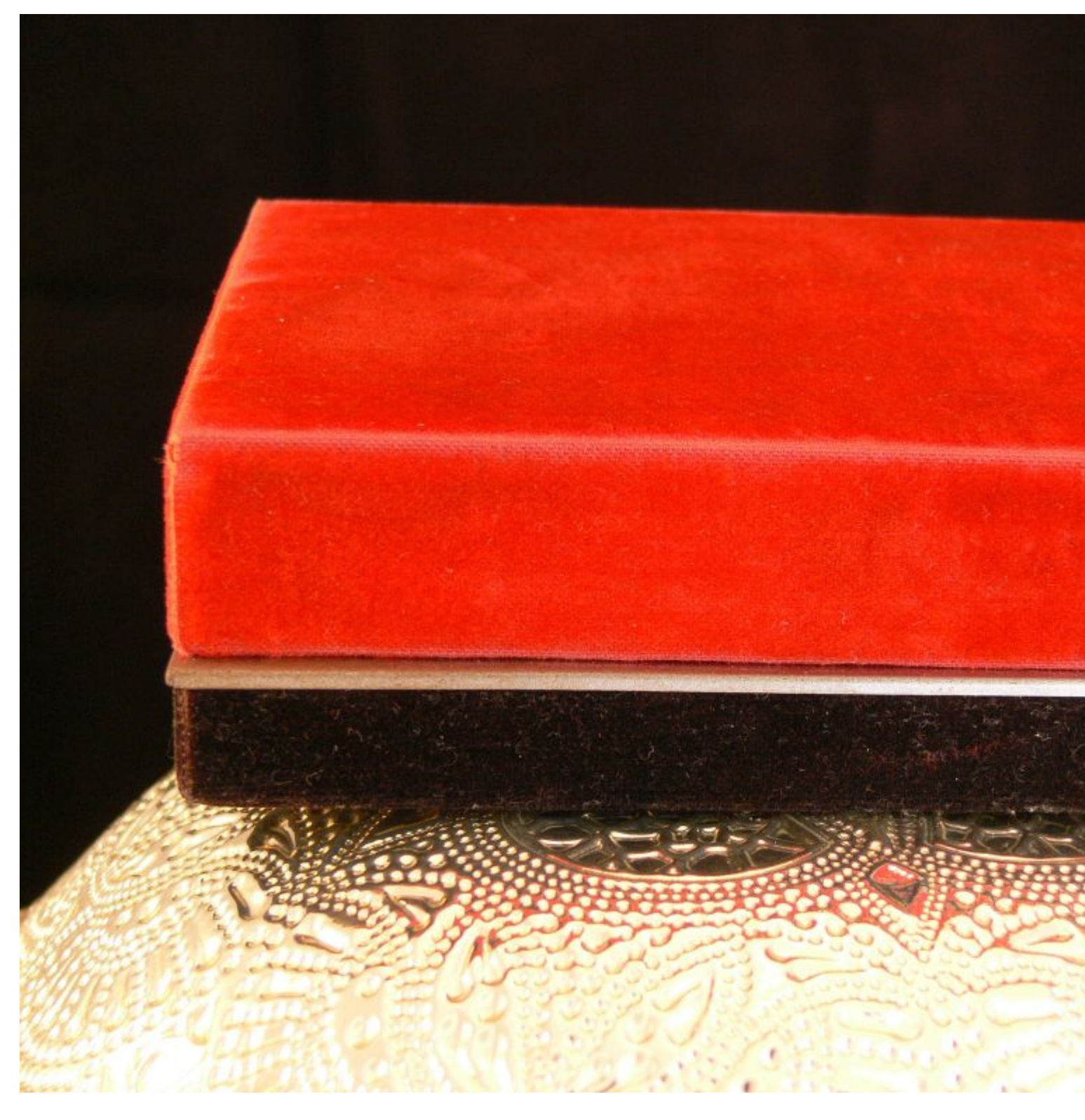
2) P1070512r.jpg, downloaded 1394 times