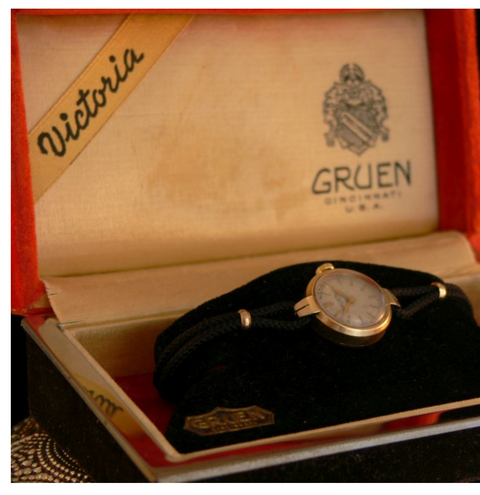
5) P1070518r.jpg, downloaded 1413 times