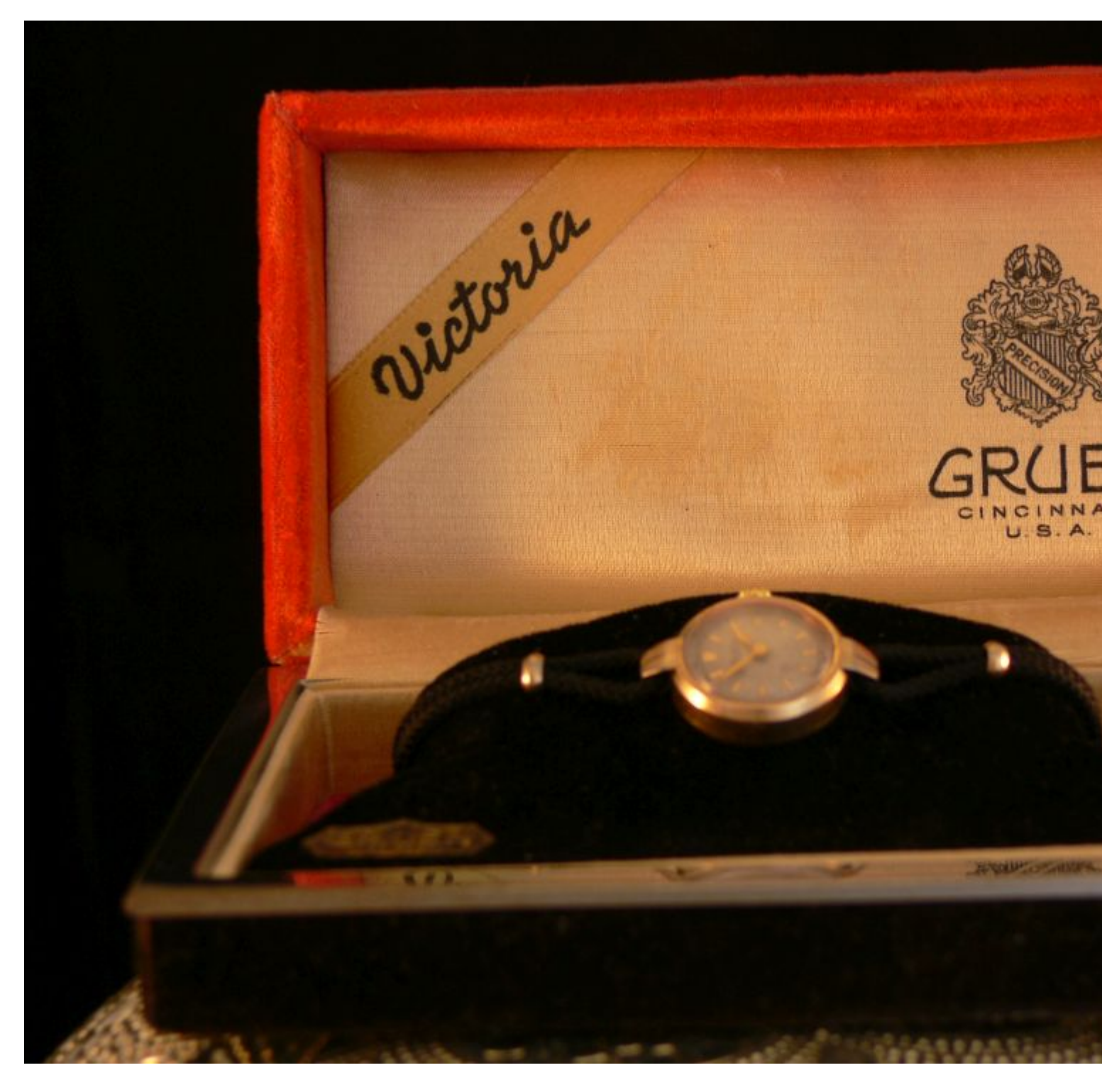
4) P1070516r.jpg, downloaded 1364 times