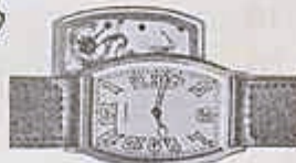
No. 111A. New strap watch for men with greater rise, tangential movement, 14 kt. solid green gold ..... $100.00 No. 111A. Sterling silver ..... $60.00

NOTE: These watches are in several sizes. Prices include your size.